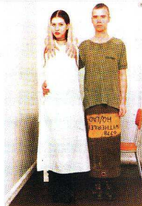
A 1993 photograph by Wolfgang Tillmans, above, is on display at the Hirshhorn, Washington. "The Archaeologists, 1968," below, is in a show paying homage to Giorgio de Chirico in Athens.

KUNSTHALLE DER HYPO-KUNSTSTIFTUNG To July 8: "Serge Poliakoff (1900-65) Retrospektive." In 1917, Poliakoff (1900-65) left his native Moscow for Paris where he lived for most of his life. After exploring figuration, he found his own pictorial idiom — abstract shapes,