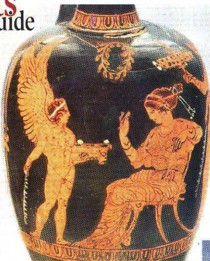
The State Hermitage Museum "Live While Ye May, Yet Happy Pair..." (Milton) — A fifth-century B.C. red-figure oinochoe, or ovoid jug with loop handle, possibly showing Aphrodite and Eros is one of the ancient Greek artworks in the Hermitage Museum exhibition, "The Aroma of Antiquity."