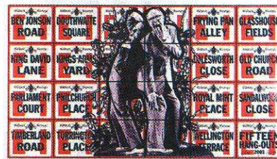
Gilbert & George's "Fifteen Hang-Outs, 2003," left, is in a display of 20th- and 21st-century artworks in Belgrade. "Gray Sea Hold Hands, 2006," below, by Feng Mengbo, is shown with other works by contemporary Chinese artists in Humlebaek, Denmark.

HARA MUSEUM To July 16: "Henry Darger: A Story of Girls at War — Of Paradise Dreamed." During his solitary life in Chicago and unknown to all, Darger (1892-1973) wrote a 15,000-page novel, "In the Realms of the Unreal," which he illustrated with hundreds of watercolors. The book and images, kept intact after his death and now held for a large part in the Musée de l'Art Brut, Lausanne, describe the fight of seven sisters against evil forces. The Outsider artist's naive style is characterized by a profusion of people in turbulent, colorful surroundings with imaginative attributes and well-defined contours. www.haramuseum.or.jp