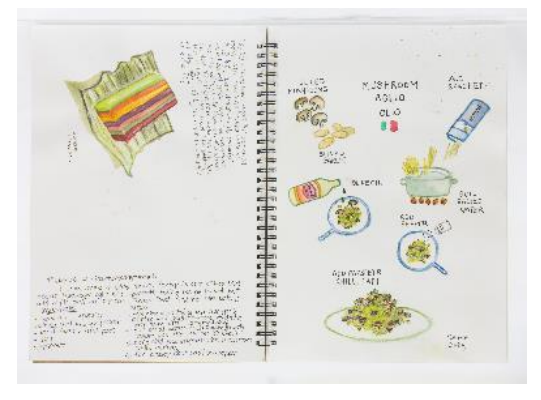
The exhibition also features sketches and paintings, alongside other pandemic-related objects contributed by the public.