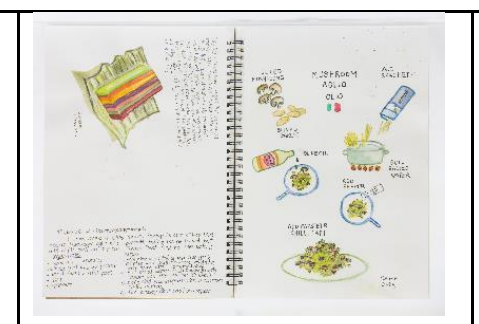
From top: Sketchbooks by Priscilla Ng and Serene Ong

USS members Serene Ong and Priscilla Ng created their own sketch journals in response to this challenge, using sketches and watercolours to depict their observations and daily routine over the Circuit Breaker period. In one of her entries, Ong painted an image of the different ingredients she had used to cook her pasta, while Ng documented a memorable celebration of her own birthday via Zoom on day 21, both scenes that have become ubiquitous in this "new normal".