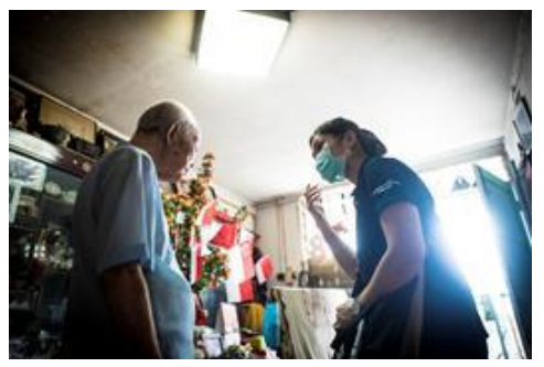
The Community Healthcare series by Edwin Koo spotlights elderly day care centres and community nurses who continued to visit patients at home even during the Circuit Breaker period.

Edwin Koo's Community Healthcare series spotlights elderly day care centres as well as community nurses who continued to visit their patients at home even during the Circuit Breaker period. The series also captures how the HCA Day Hospice recreated an airport and flight experience for its 25 residents. Brian Teo's Safe Distancing Ambassadors series offers an intimate view of the experience of public safety officers who work tirelessly to maintain safe management measures in public spaces during the pandemic.