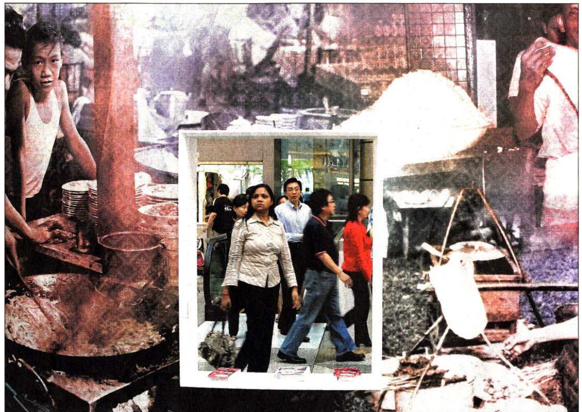
A WINDOW TO THE PAST: Old photos and exhibits at the launch of the Singapore Heritage Festival at Suntec City yesterday. This year's festival takes place in various locations islandwide till July 29.

Post your comments online at www.straitstimes.com