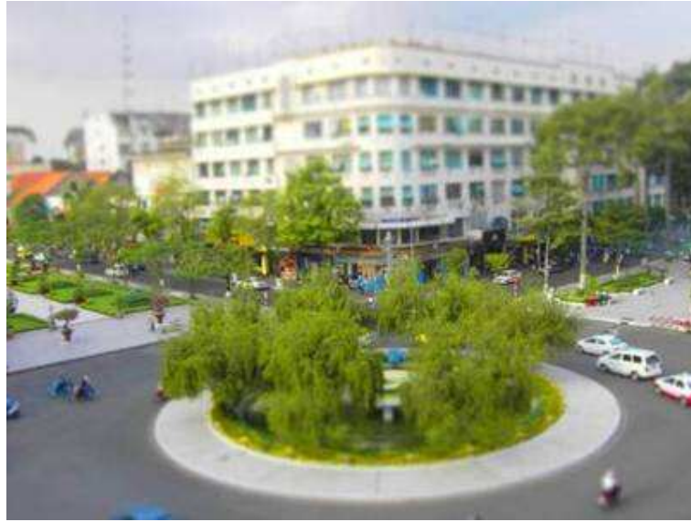
Rich Streitmatter-Tran The Jungle Book 2009 Photo series Singapore Art Museum Collection