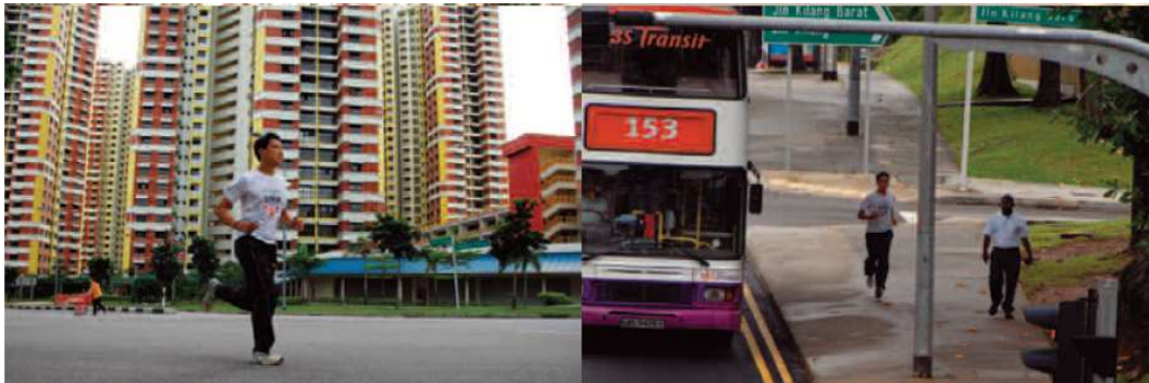
Jun Nguyen-Hatsushiba Breathing is free 2009 Video installation Singapore Art Museum Collection