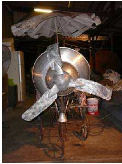
Mark R Kaufmann The Fabulous Flights of Fancy Time Machine 2009 Interactive photo installation Singapore Art Museum Collection