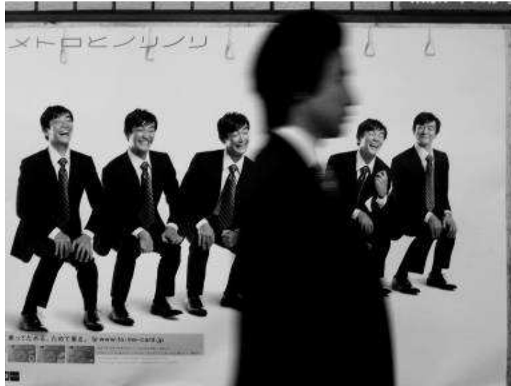
Xavi Comas Pasajero/Passenger 2007 Video projection and prints Singapore Art Museum Collection