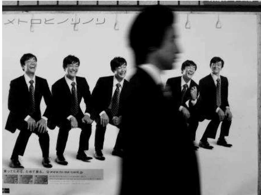
Xavi Comas Pasajero/Passenger 2007 Video projection and prints Singapore Art Museum Collection

The Singapore Art Museum (SAM) is proud to present TransportASIAN , its first photography exhibition featuring Southeast Asian-based artists. The composite term, TransportASIAN captures travel in time and space within Asia. The works not only document the history of transportation in Asia, they are also interpretations and metaphorical explorations on the theme of travels. TransportASIAN showcases works by 15 artists from Singapore, Myanmar, Vietnam and Thailand in the way their photographic works relate to Time, Space, Action and Fiction.