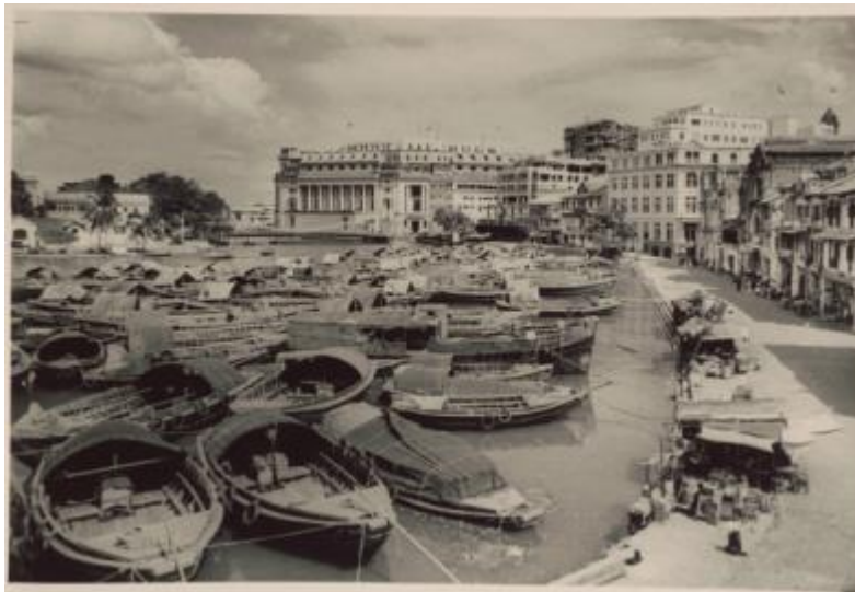
Boat Quay in the 1950s.

In the 1990s, Boat Quay's traditional shophouses were restored as modern shops and riverside eateries.