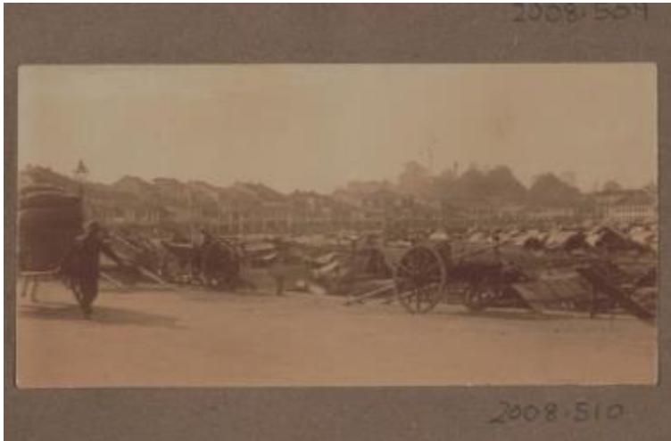
Bullock Carts at the Singapore River, late 1800s.

Today, Clarke Quay houses the largest surviving cluster of riverside warehouses as well as many traditional buildings. The oldest surviving building here, the River House, is an exquisite Teochew-style mansion from the 1880s. Another landmark is The Cannery, an 1891 warehouse that was later converted into a pineapple cannery. There is also a replica of Whampoa's Ice House, which stood near Hill Street from 1854 until 1981