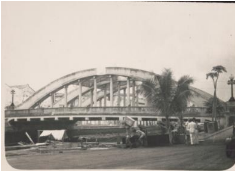
Elgin Bridge in the 1930s.

The original Elgin Bridge was later replaced by a new structure completed in 1929, which survives today. The bridge features cast-iron roundels with a lion, which were crafted by Rodolfo Nolli, an Italian sculptor who also worked on the Tanjong Pagar Railway Station (1932), Raffles Hotel (1887) and the former Supreme Court building (1939).