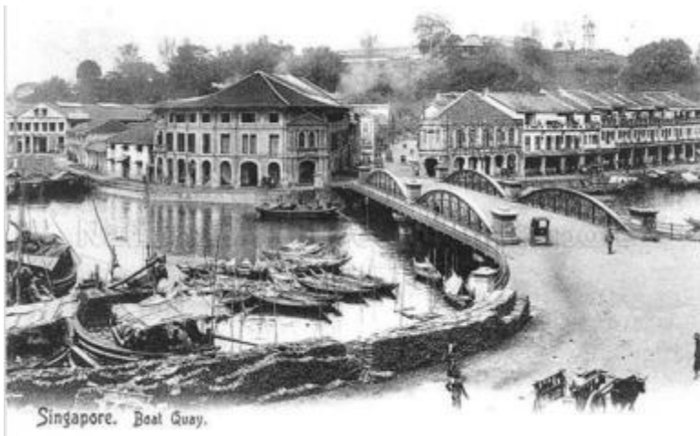
Read Bridge at Boat Quay, Singapore, early 1908.

Read Bridge was extensively repaired and converted into a pedestrian bridge in 1991 as part of the Urban Redevelopment Authority's masterplan to beautify and upgrade the bridges of the Singapore River.