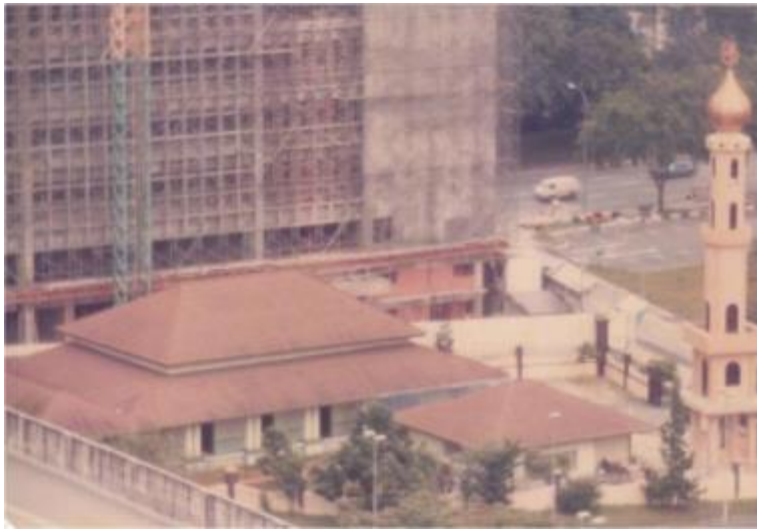
Masjid Omar Kampong Melaka mosque compound. The main building was built in 1855.

The original timber mosque was rebuilt in 1855 as a brick hall with a pyramidal tiled roof. This structure remained until the 1980s, when a new worship hall for a thousand people was built.