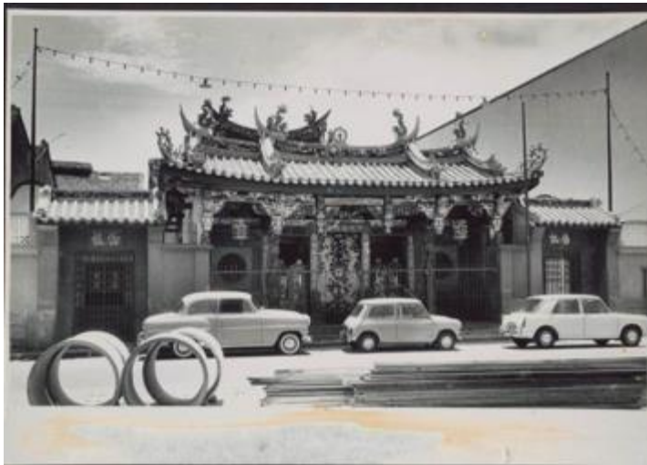
Tan Si Chong Su Temple at Magazine Road, 1950s.

Clemenceau Bridge was first built in 1940 and named after French Prime Minister Georges Clemenceau, who visited Singapore in 1920. It replaced an older structure called Pulau Saigon Bridge, which linked the riverbank to a former island on the river. Clemenceau Bridge was rebuilt in the early 1990s.