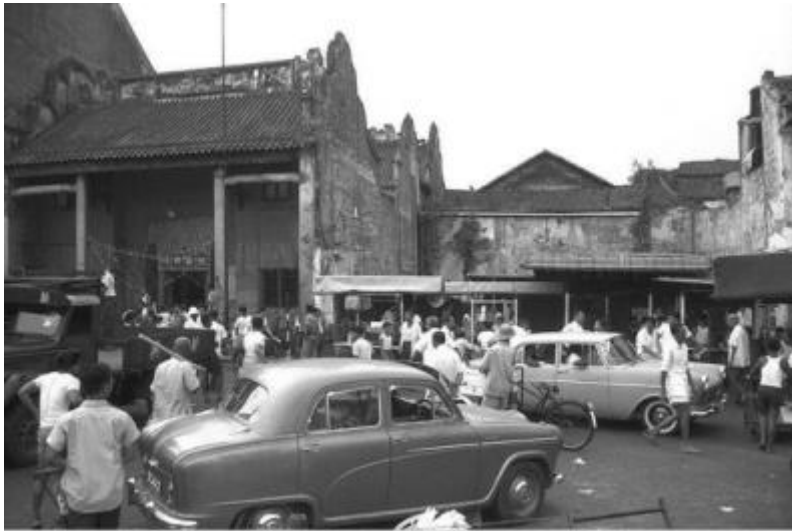
Outside Thong Chai Medical Centre, 1960s.

Designed in a Cantonese style known as zhu tong wu (Chinese for "bamboo house"), the building is long and segmented, with four halls separated by three courtyards. The building was declared a National Monument in 1973.