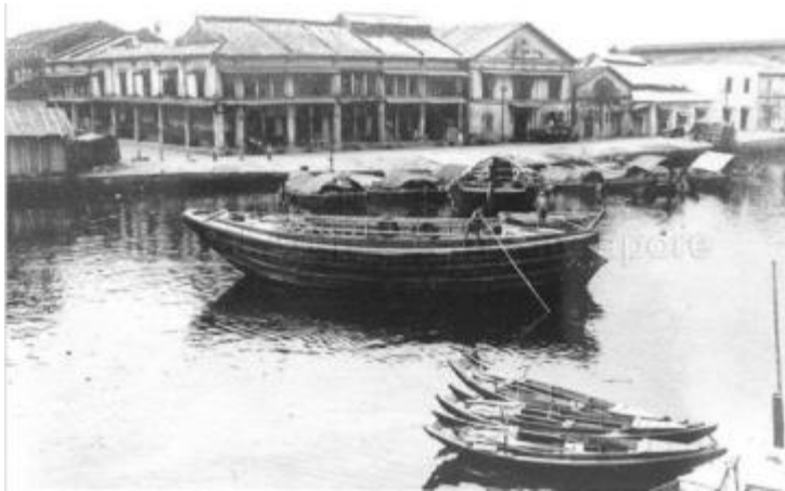
Robertson Quay in the 1955

In the 1990s, Robertson Quay was redeveloped into a modern neighbourhood with housing, recreational and arts facilities.