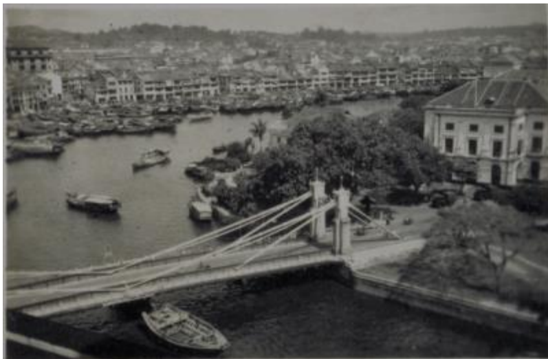
Cavenagh Bridge, with Boat Quay in the background, 1950s.

After 1910, when the nearby Anderson Bridge was opened, Cavenagh Bridge was converted into a footbridge linking Empress Place and the commercial district.