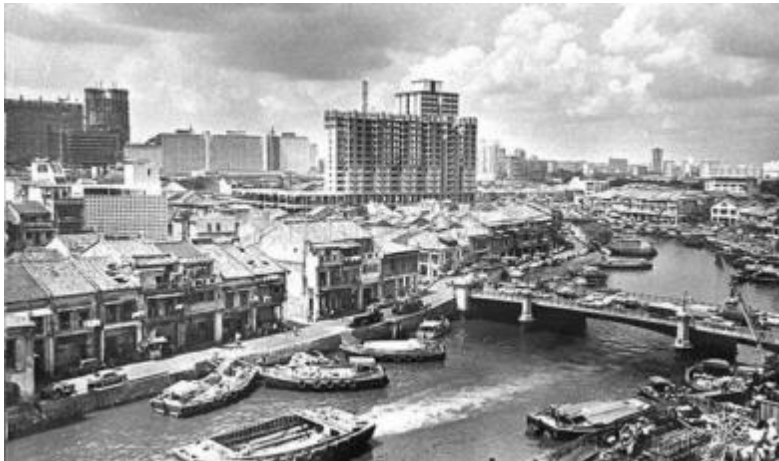
Scene of Singapore River with Ord Bridge, 1970s.

The bridge linked River Valley Road to Magazine Road, where ammunition was once stored. Due to its original paintwork, Ord Bridge was also known as Green Bridge in the various local languages, as was Toddy Bridge, as many shops selling toddy (palm liquor) operated in the area until the 1970s.