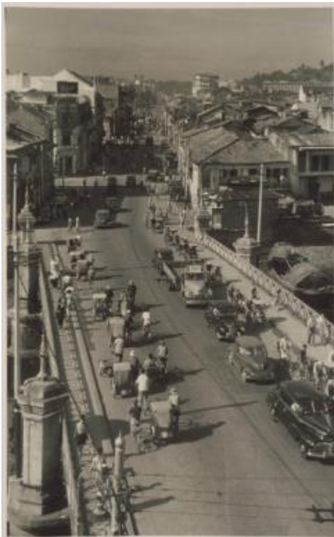
Coleman Bridge in the early 1900s.

The present Coleman Bridge retains many features of the 1886 structure, such as graceful shallow arches, decorative columns, old gas lamp stands and iron balustrades or railings with Victorian motifs.