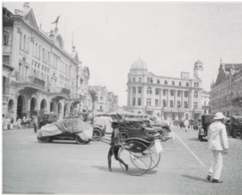
Raffles Place, 1910s.

Singapore's only underground mosque, Masjid Moulana Mohamed Ali was originally established at Market Street in the 1950s by Indian Muslim leaders as a place of worship for fellow Muslims working in the area. The mosque moved to the basement of UOB Plaza in 1994.