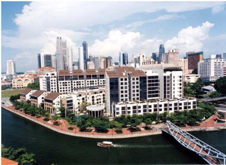
Scene of Singapore River with Alkaff Bridge, 1990s.