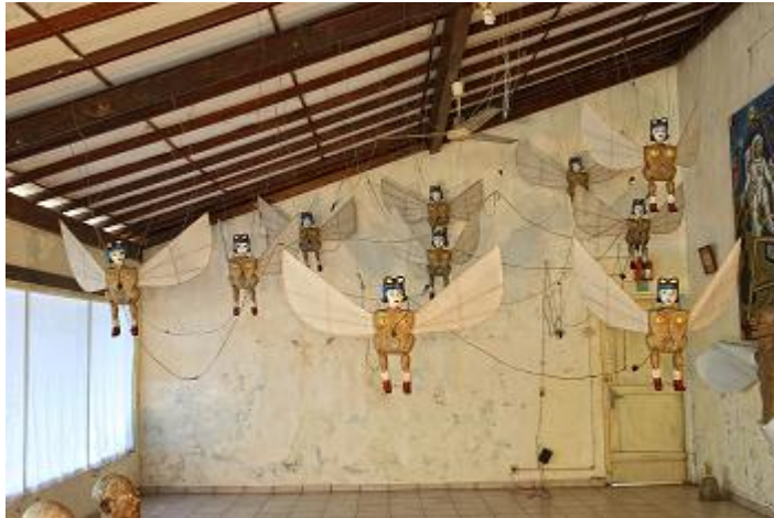
Female Flying Angels by Heri Dono, Artist's Collection

Venue: Musée d'art contemporain de Lyon, Lyon