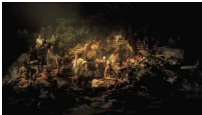
Ho Tzu Nyen, EARTH , 2009, video.