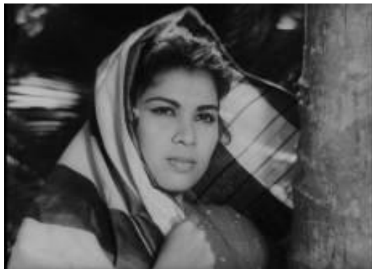
Sultan Mahmud Mangkat Di Julang