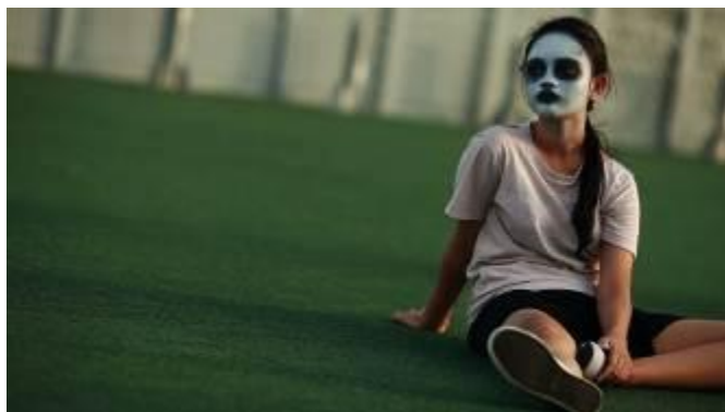
Sookoon Ang, Exorcize me , 2013, video.