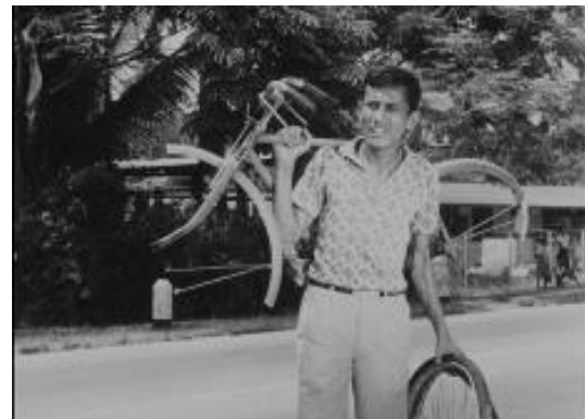
Gado Gado