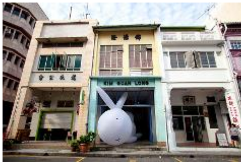
Once Upon A House by Dawn Ng, 2010, photograph, 80 x 117cm.