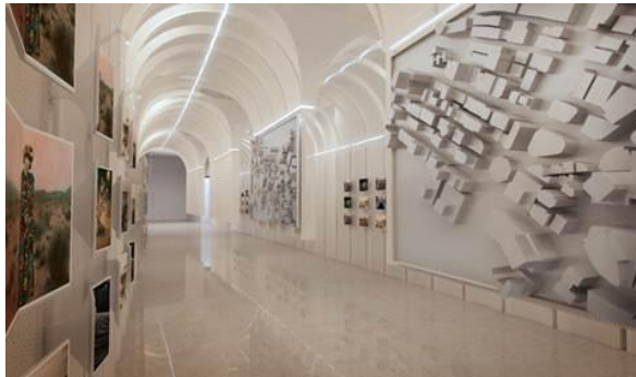
1000 Singapores: Eight Points of the Compact City by DesignSingapore Council.

A small island city-state. One compelling compact city model from a place in Southeast Asia. Organised by the DesignSingapore Council, 1000 Singapores: Eight Points of the Compact City presents Singapore's proposal for an effective model of a compact and sustainable city for the future that embraces economic viability, liveability and social equity. Originally presented at Venice Biennale 2010, the exhibition is updated, and expanded for the Singapore Festival in France 2015.