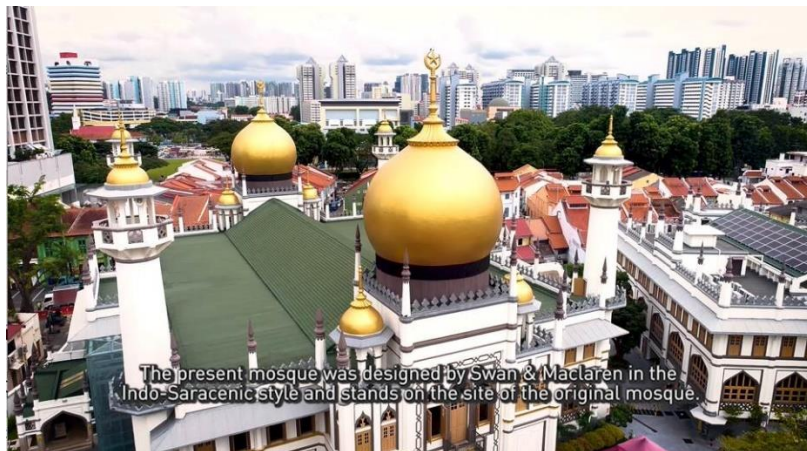
Screengrab from Eye in the Sky series featuring Sultan Mosque

Besides photography and videography, PSM started using drones in 2018 as part of NHB's Eye in the Sky series of aerial videography projects, to capture monuments and present them in a different light to facilitate a renewed appreciation of their unique and distinctive architecture.