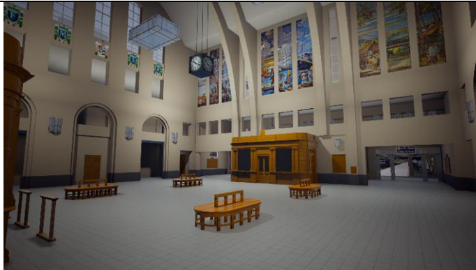
View of Orient Express on the platform