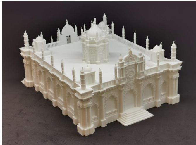
3D printed model of Abdul Gafoor Mosque.

For PSM's 50th anniversary, miniature replicas of 11 monuments were created using 3D printing technology to highlight the architectural diversity and features of our monuments in close-to-scale form, offering a miniaturised viewing experience for the public to learn more about these historic buildings.