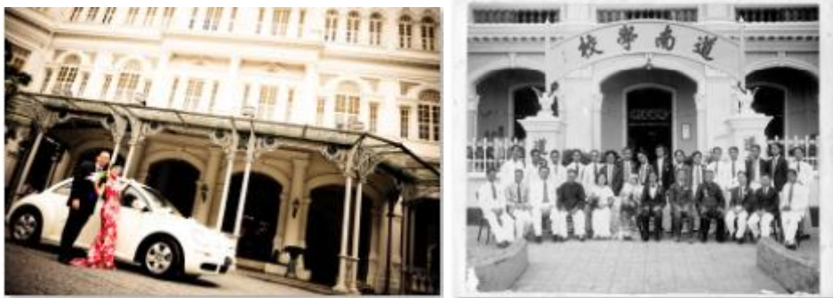
Photos collected featured Raffles Hotel (left) and the Former Tao Nan School (right).

PSM engages the community to promote greater public awareness and appreciation of our National Monuments. One of PSM's early community outreach efforts was a 2012 exhibition titled Monumental Weddings which presented a collection of 150 historic and contemporary wedding portraits taken at 32 monuments. These photographs were collected via a public call, as well as sourced from archives, photographers and monument owners.