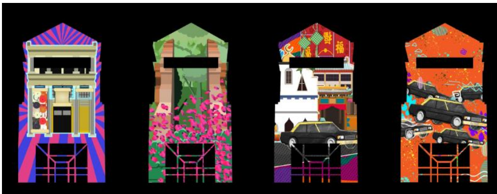
Artists’ impression of Madeleine, courtesy of Lueur

4 SNF’s popular projection mapping installations return with six works illuminating iconic buildings in the city. Rediscover Singapore’s mythical origins at the National Museum of Singapore with Stories from Forbidden Hill by Maxin10sity , then head to the National Archives of Singapore for a colourful throwback to the cinema of times past with Midnight Show at the Capitol by MOJOKO , which revisits the classic movie posters that used to adorn the walls of Capitol Theatre and Cathay Picture House.