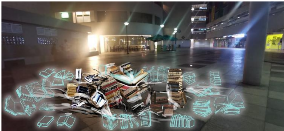
Artist's impression of City of Books, courtesy of Fish Jaafar

6 Night Lights makes its return with 15 installations dotted around the BBB precinct, bringing to life everyday spaces that festival-goers are familiar with in the day but may not have experienced in the beauty of the night. The installations will shine a light on the precinct's rich history and heritage with Night Lights like Paddy Fields by FARM , inspired by rice cultivators along Sungei Brass Brassa; and An Ocean Without The Anchor by Speak Cryptic , that pays homage to the Bugis people and their history as seafarers.