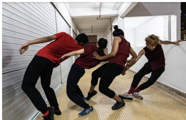
Enactment of Discoloo Centre