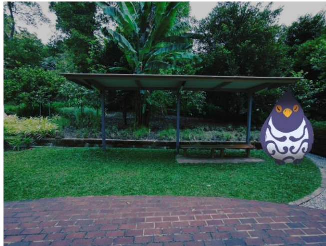
Artist's impression of tobyato bird pitstop, courtesy of tobyato

technology on our daily lives. City of Books , a large-scale anamorphic pavement mural by Fish Jaafar , sheds light on the decline of print media.