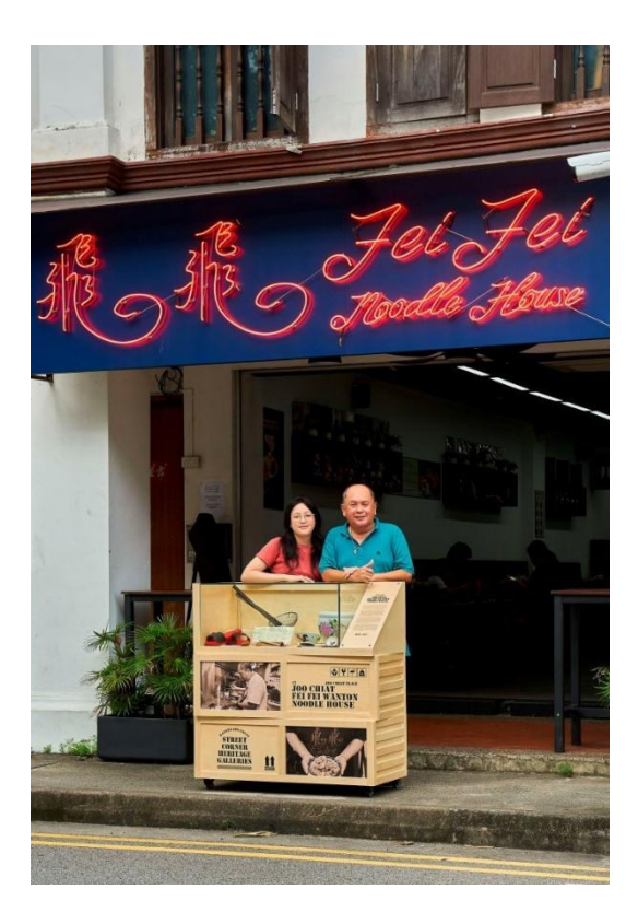
Joo Chiat Fei Fei Wanton Noodle House