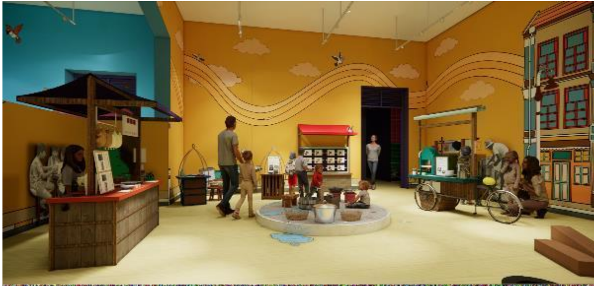
Artist's impression of Past (street hawkers) section