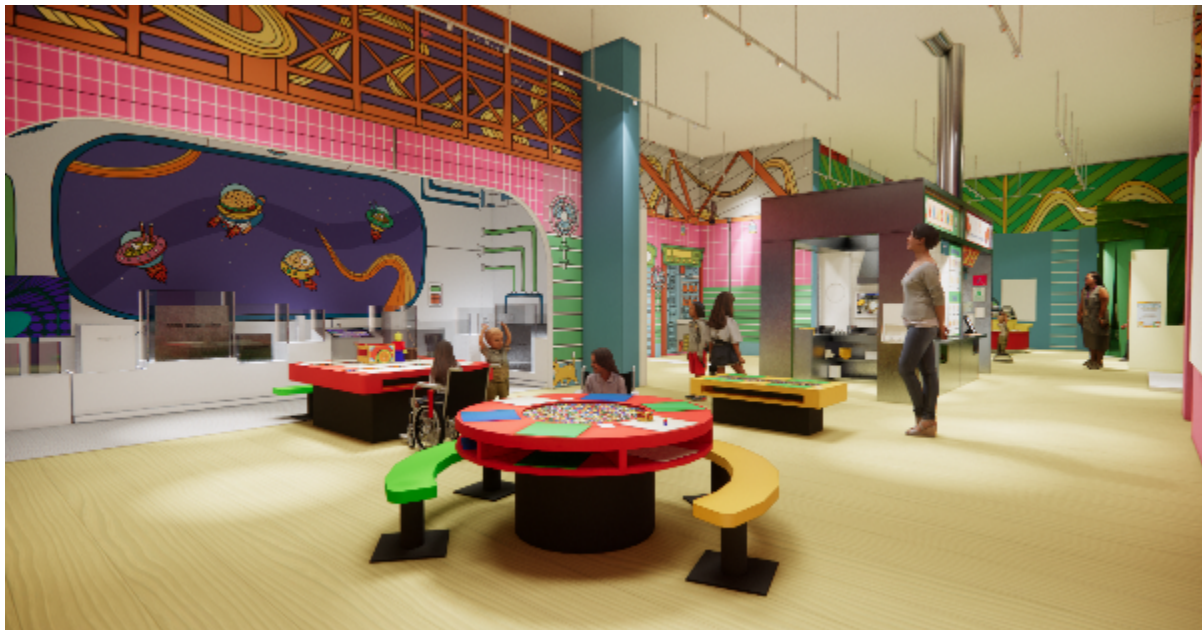
Artist's impression of Present and Future sections