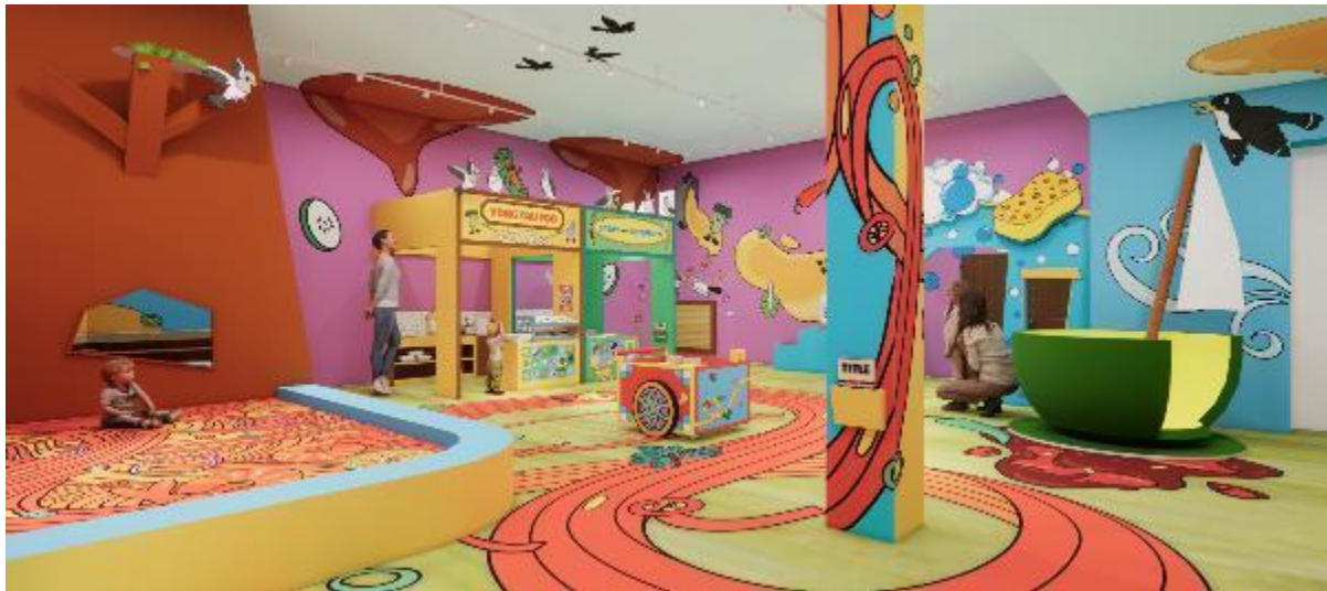
Artist's impression of Play Pot

The exhibition is presented by Children's Museum Singapore, an institution of National Heritage Board and supported by MCCY. The exhibition sponsors are National Environment Agency, Health Promotion Board and The LEGO® Group.