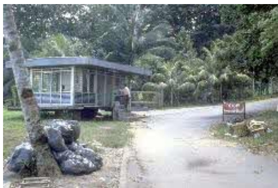
Kampong Lorong Fatimah immigration post, 1989

Woodlands Saturday night market and return wearing their new hauls; students like Isabel Chang who would wake up as early as 4am daily to get to school in Singapore and only return home in Johor at 8pm; and workers who were stranded on either side when the Causeway was shut down in March 2020 because of the pandemic.