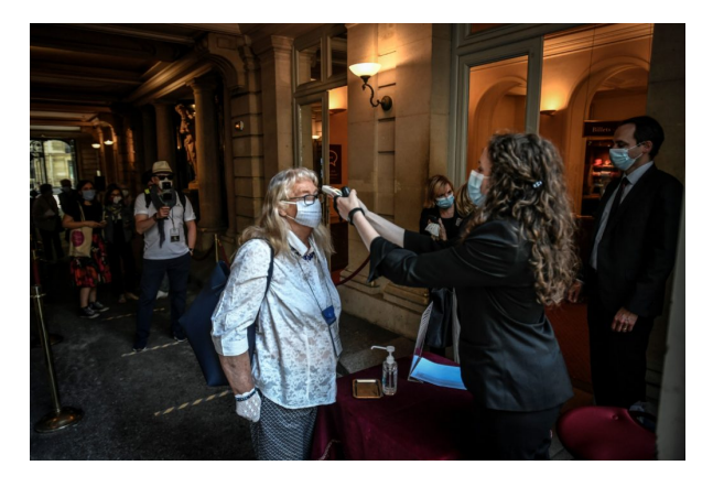
A staff member checks the body temperature of a visitor at the entrance of a Turner exhibition at the Jacquemart-André Museum in Paris on May 26, 2020.

Technologies for mass temperature testing and measuring social distance are developing, but for the most part not yet operational. The availability of cleaning materials, PPE, protective dividers, and other equipment varies enormously. Every community is in a different place on the trajectory of the pandemic. And at some unknown point—as most believe and all hope—this moment will be behind us, requiring museums to revisit whatever measures have been put in place.