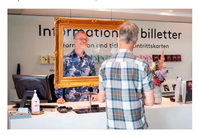
An employee is protected by a shield at the box office of the newly reopened ARoS Museum of Art in Aarhus, Denmark on May 22, 2020.

So how to navigate this maze? The table below consolidates current thinking about the operational realities of reopening in a way that could be helpful to museum professionals at the sharp end of re-entry, as they try to find their way to a sustainable balance of public access, public safety, and financial and organizational reality. The chart is a work of aggregation rather than invention, and it has no claim to being the first or the final word on how to reopen, let alone when . Rather, it is a snapshot of informed guidance and opinion currently available, drawing on sources in the museum field and outside of it as of May 2020. (For a full list of sources, scroll to the bottom and click to unroll.)