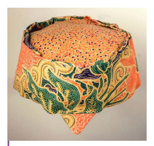
Up close with a talapa , a traditional batik headgear worn by the men of the Chetti Melaka community. Collection of Indian Heritage Centre.