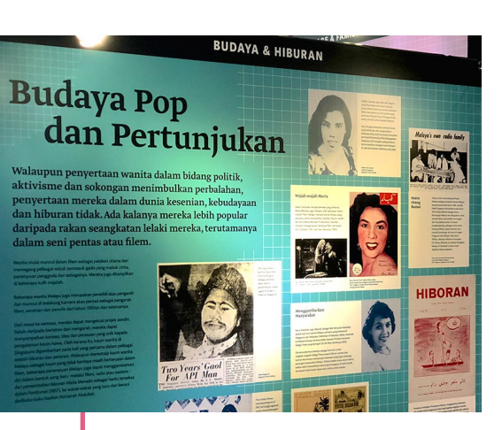
Women in Action on display at Yale-NUS College Library in 2018.