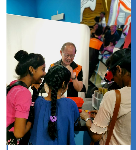
A senior guide and youth from the Science Explainers Academy participating in the Eye Can See activity where guests learn about vision, long- and short-sightedness.

The centre also celebrates the International Day for Older Persons (IDOP) on 1 October to highlight the important contributions of Singapore's elderly to society and raises awareness of the opportunities and challenges of ageing in today's world. In 2019, the centre's senior guides worked with youths from Science Explainers Academy to facilitate a series of curated activities that encouraged inter-generational bonding and promoted awareness of the challenges faced by Singapore's ageing population.