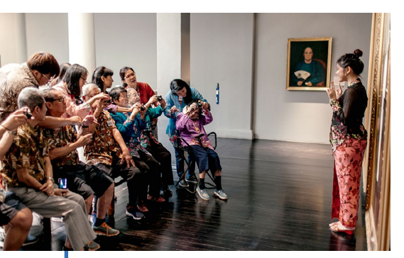
Seniors from the Alzheimer's Disease Association practising basic photography skills at the Peranakan Museum.