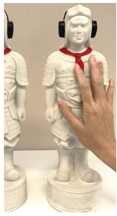
The SAM Touch Collection was developed to engage the visually-impaired community, seniors, and persons with disability.

The SAM Touch Collection is an initiative by the Singapore Art Museum (SAM). It is a portable and interactive collection of artwork adaptations based on the National Collection for the visually-impaired community, seniors and persons with disabilities. SAM is currently working on expanding the SAM Touch Collection and the accompanying resources such as audio description recordings and reproductions of the finer details of selected artworks. The museum will also be recruiting and training volunteers as part of this initiative. Click here to learn more about SAM's access programmes.