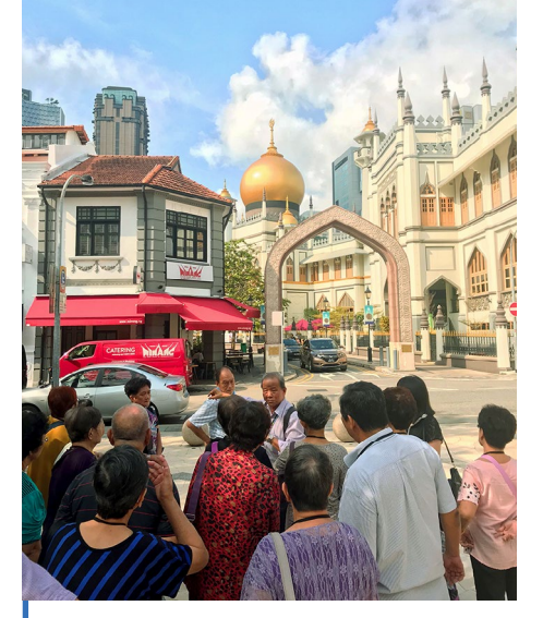
A Reminiscence Walk taking place in the Kampong Gelam precinct.