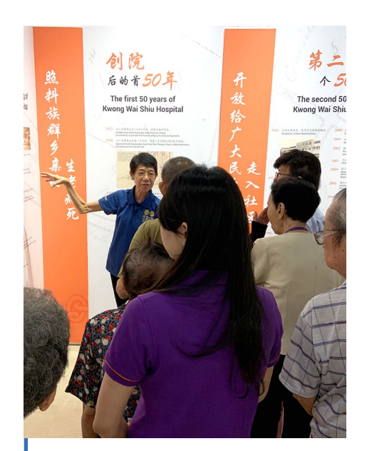
Seniors visiting the Kwong Wai Shiu Hospital Heritage Gallery as part of Reminiscence Walks at Balestier.