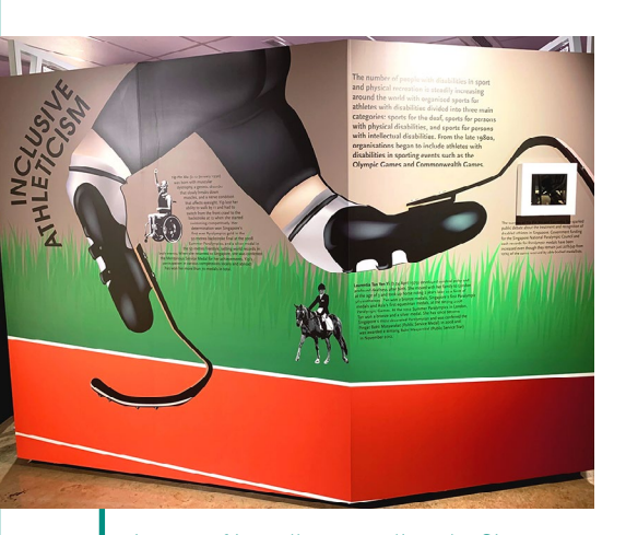
As part of its gallery storyline, the Singapore Sports Museum highlights the importance of inclusive athleticism.