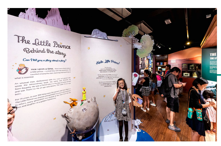
The Little Prince: Behind the Story exhibition presented by Singapore Philatelic Museum.

The museum also partnered with Ngee Ann Polytechnic's Dialogue in the Dark to co-curate a special tour of the touchable sculptures where visitors were blindfolded and led by visually impaired guides.