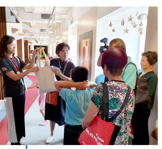
A docent engaging participants in a fun activity during the Dialect Tour .