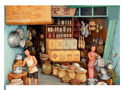
A mural featured in Moving Memories at the National Museum of Singapore.

museum's prized William Farquhar Collection of Natural History Drawings, or create their own masterpieces using the colouring templates of the plants from the collection. Food lovers can also try to create dishes inspired by various eras of Singapore's history, with recipes presented in the museum's video series Tastes of Our Time . These resources are available online here