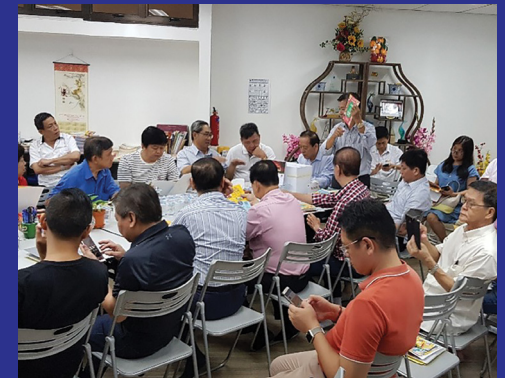
Sharing session by FMAS to hawkers' associations on the nomination.