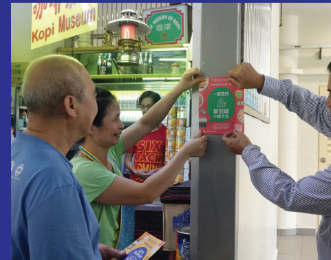
Hawkers displaying decals about the nomination at their stalls.