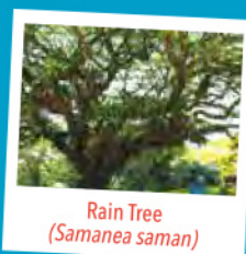
Rain Tree (Samanea saman)

Victoria Theatre and Victoria Concert Hall, Empress Place