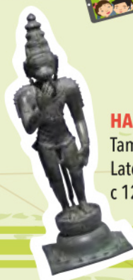
HANUMAN Tamil Nadu, Late Chola Period, c 1200

Take a WE-FIE with these artefacts. #FunWithHeritage