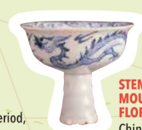
STEMCUP WITH MOULDED FLORAL DESIGNS China, Yuan dynasty