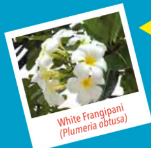
White Frangipani (Plumeria obtusa)

The White Frangipanis were specially chosen to complement the white Stamford Raffles statue at Raffles Landing. The flowers of the White Frangipanis are sweet smelling.