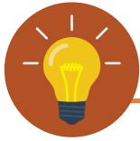
FIGURE IT OUT!

Name two crops grown in Yishun in the early days - G _ _ B _ _ R and _ _ _ P _ _ .