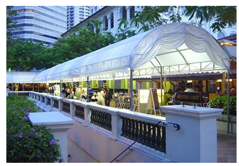
Type 1: Open-sided tentage