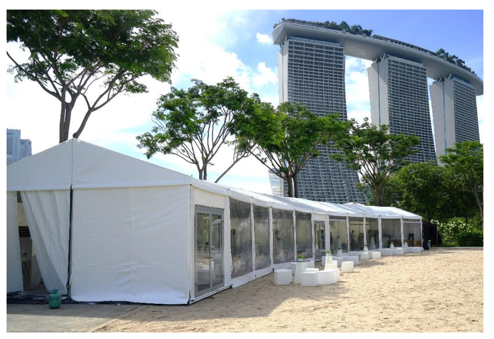
Type 2: Enclosed tentage (for aircon)