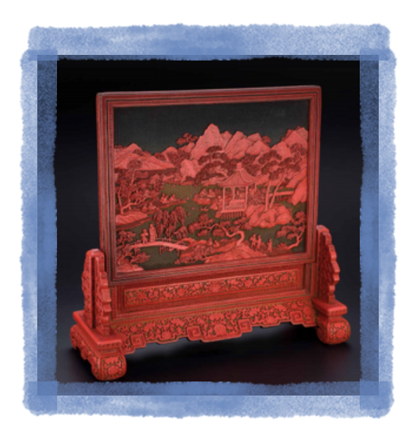
Table screen: Gathering of scholars

The use of jade in Chinese culture goes back a few thousand years. This jade sculpture was likely placed atop a scholar's desk.