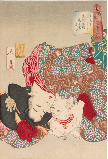
Tsukioka Yoshitoshi. Looks annoyed.