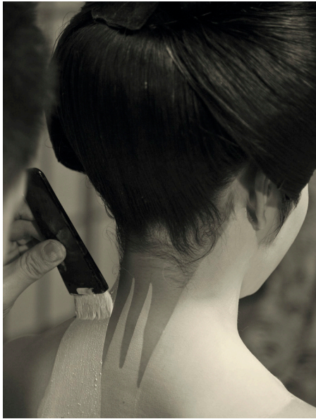
Maiko having the nape of her neck painted with the sanbonashi design for formal occasions.