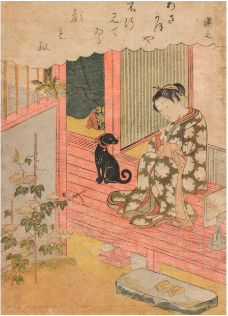
Suzuki Harunobu. Renshi.