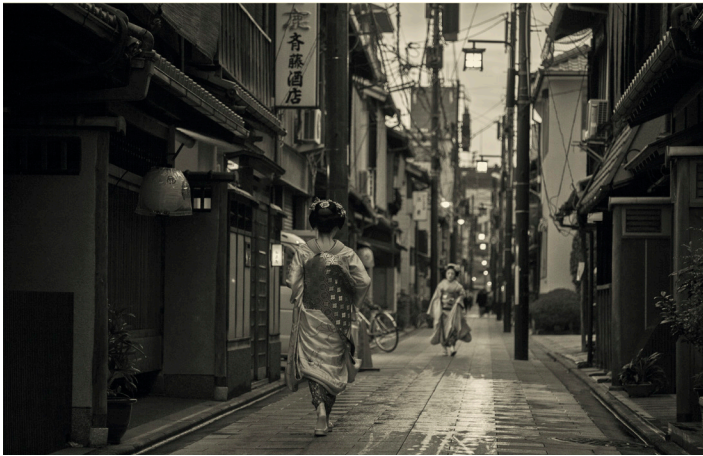
A maiko going to her appointment in the kagai.