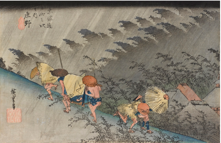
Utagawa Hiroshige. Shōno: Driving rain.