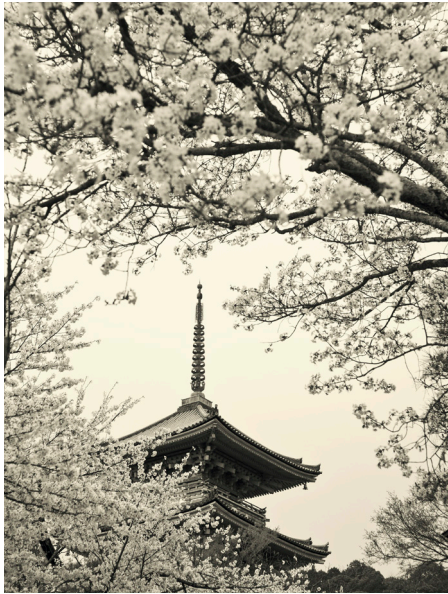
Shinnyodo Temple Pagoda with sakura flowers (cherry blossoms).