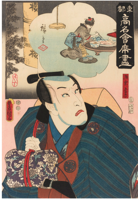
Utagawa Kunisada, aka Toyokuni III x Utagawa Hiroshige. The Sakurai Restaurant: Actor Ichikawa Kodanji IV.