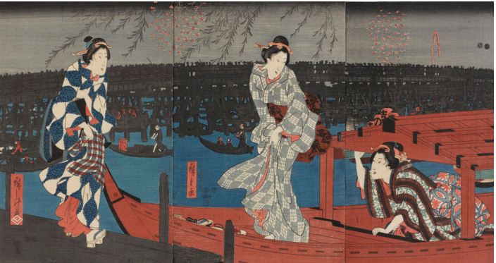
Utagawa Hiroshige. Fireworks at Ryōgoku.