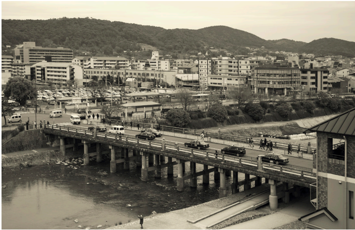
Sanjō Bridge, Kyoto