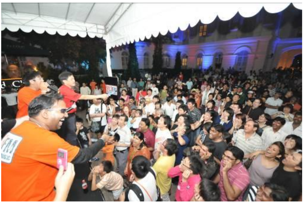
Enthusiastic crowds setting the record Singapore's Loudest Laugh By A Group at countdown party at the Asian Civilisations Museum's countdown party.