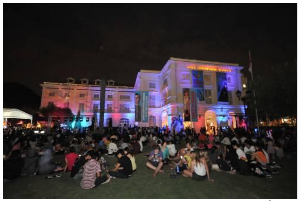
More than 12,000 visitors ushered in the new year at the Asian Civilisations Museum's countdown party.

High-resolution images available for download: https://rcpt.yousendit.com/797257546/69612f02f588fe232e3256668c7744c5