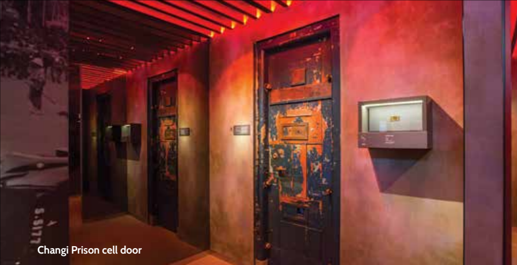
Changi Prison cell door