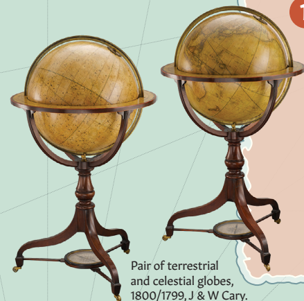
Pair of terrestrial and celestial globes, 1800/1799, J & W Cary.