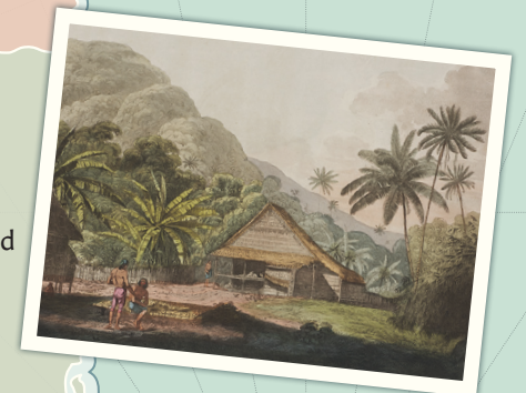
View in the Island of Cracatoa, 1809 [1820], John Webber.

The places and peoples of the East Indies were often fashioned into landscapes and portraits that reflected the imagination of European artists, and along with that, the worldviews and stereotypes they held. The artworks presented here show how the European fascination with the “exotic” made way for more romanticised views of the East Indies.