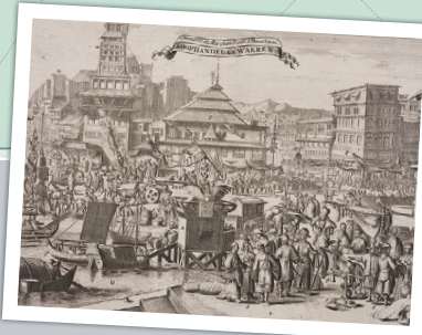
View of Banten, early 18th century, Published by Pierre van der Aa.

Come face to face with the old-world grandeur of Aceh, the bustling port city that was the first destination of the English East India Company in 1602. Experience that encounter with a dramatic, life-sized, panoramic projection that sets the stage for the rest of the exhibition.