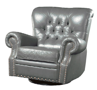
Who did this armchair belong to?

Singapore became an independent nation in 1965. Many political leaders contributed to the development of independent Singapore. Find out more about them in this section of the gallery.