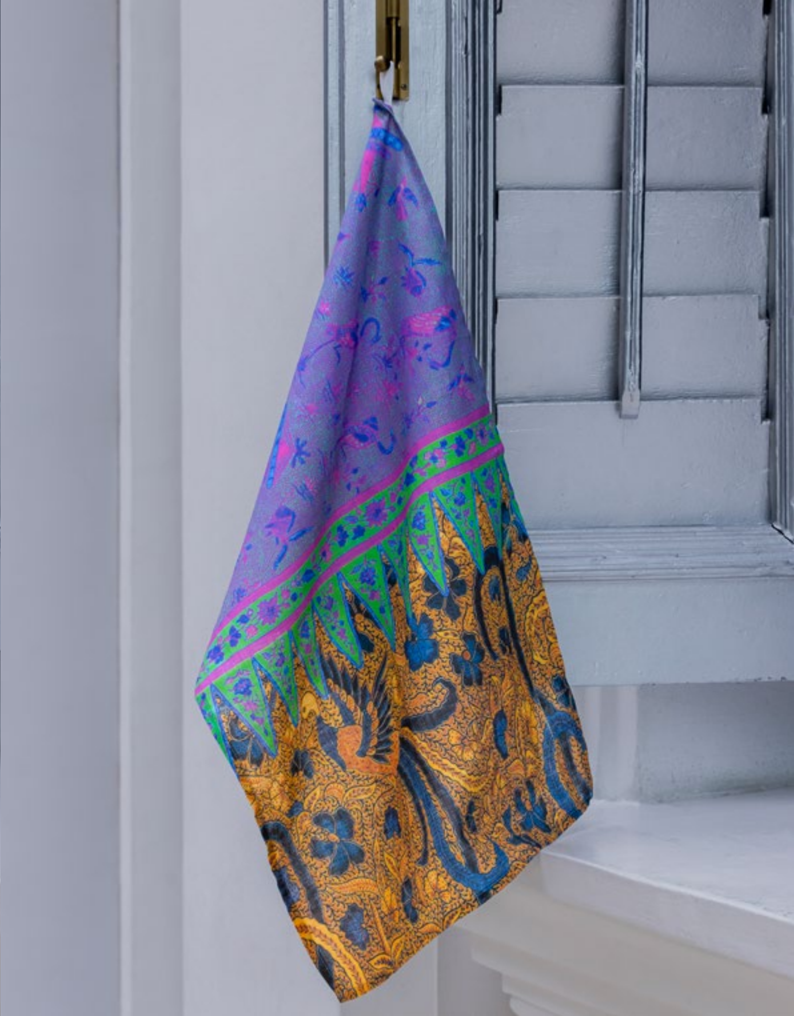
NATIONAL COLLECTION X MUSEUM MARTKET LINEN TEA TOWEL. MOTIFS TAKEN FROM MALAY BATIK SARONG AND BATIK SKIRT CLOTH WITH BIRDS, BOATS AND AEROPLANES.