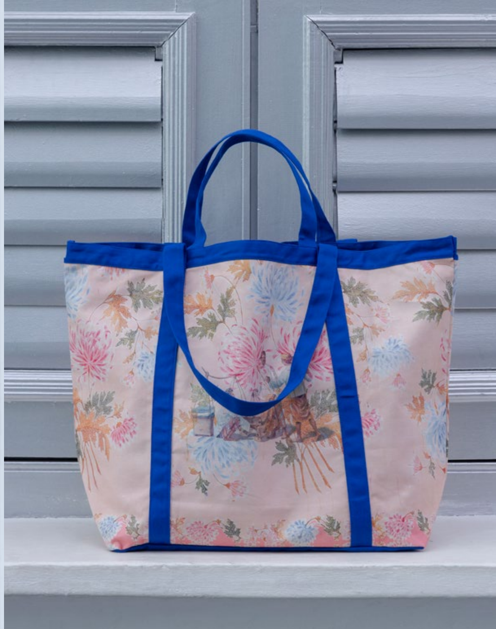
NATIONAL COLLECTION X MUSEUM MARTKET COTTON TOTE BAG. MOTIFS TAKEN FROM A PEDLAR OF BATIK, AND SARONG.