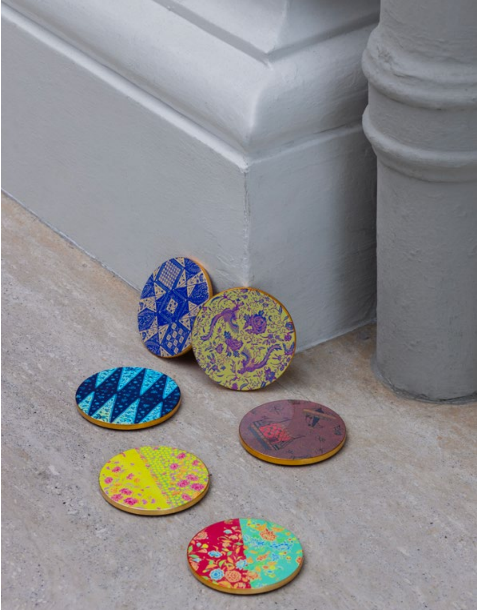
NATIONAL COLLECTION X MUSEUM MARTKET LACQUER COASTERS SET OF 6 WITH HOLDER. COLLAGE MOTIFS TAKEN FROM DIFFERENT ETHNIC FABRICS.