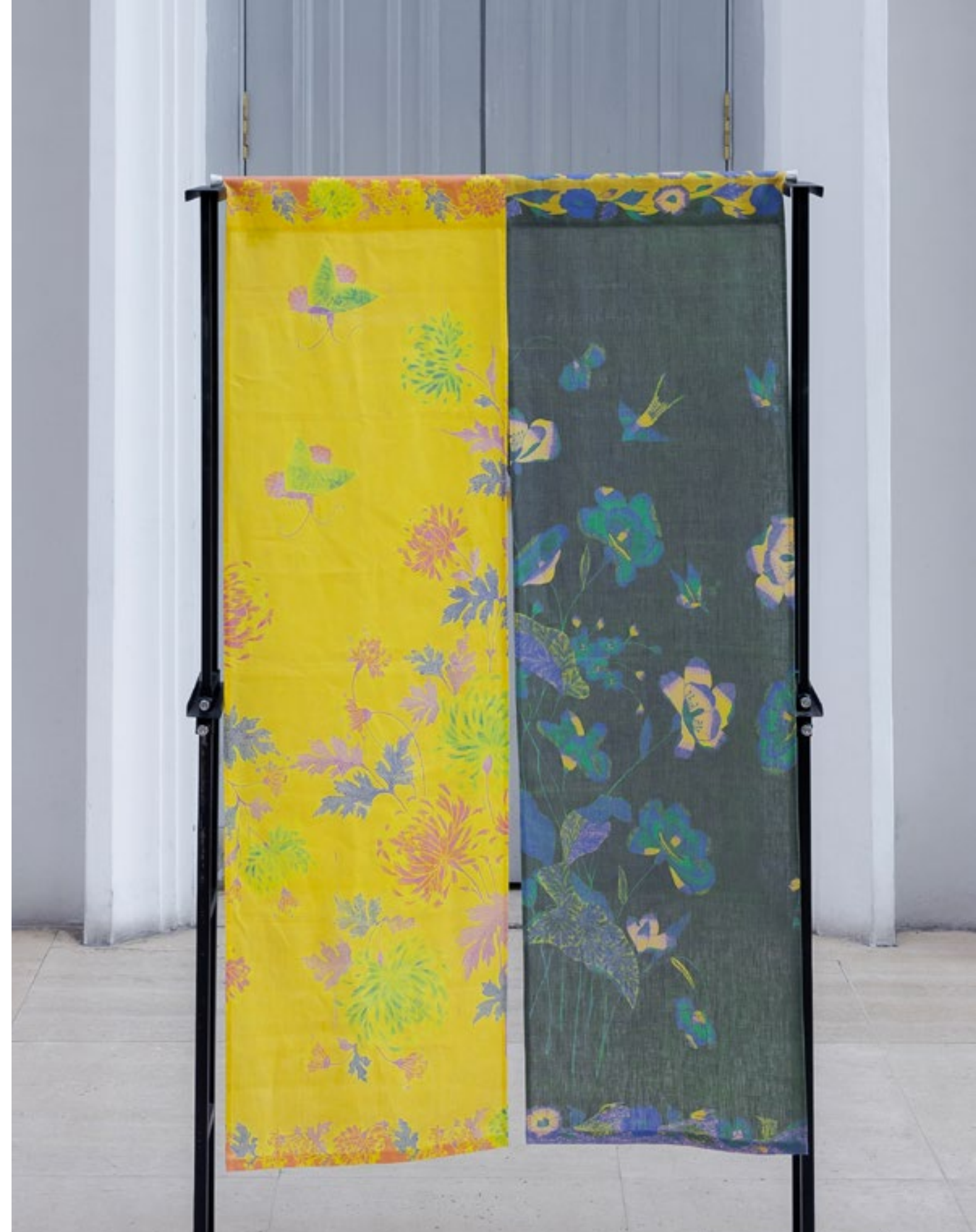
NATIONAL COLLECTION X MUSEUM MARTKET LINEN NOREN DOOR CURTAIN. JUXTAPOSED MOTIFS TAKEN FROM DIFFERENT SARONGS.