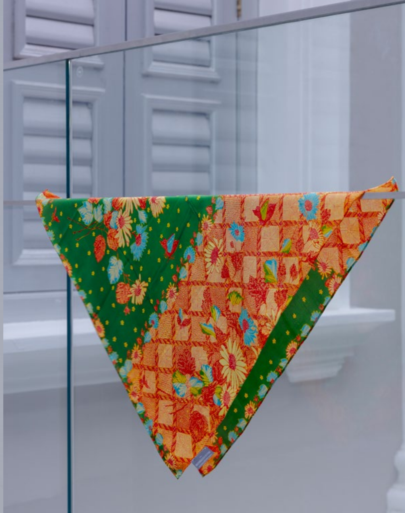
NATIONAL COLLECTION X MUSEUM MARTKET SILK SATIN HAND-ROLLED SCARF. MOTIFS TAKEN FROM SARONG.