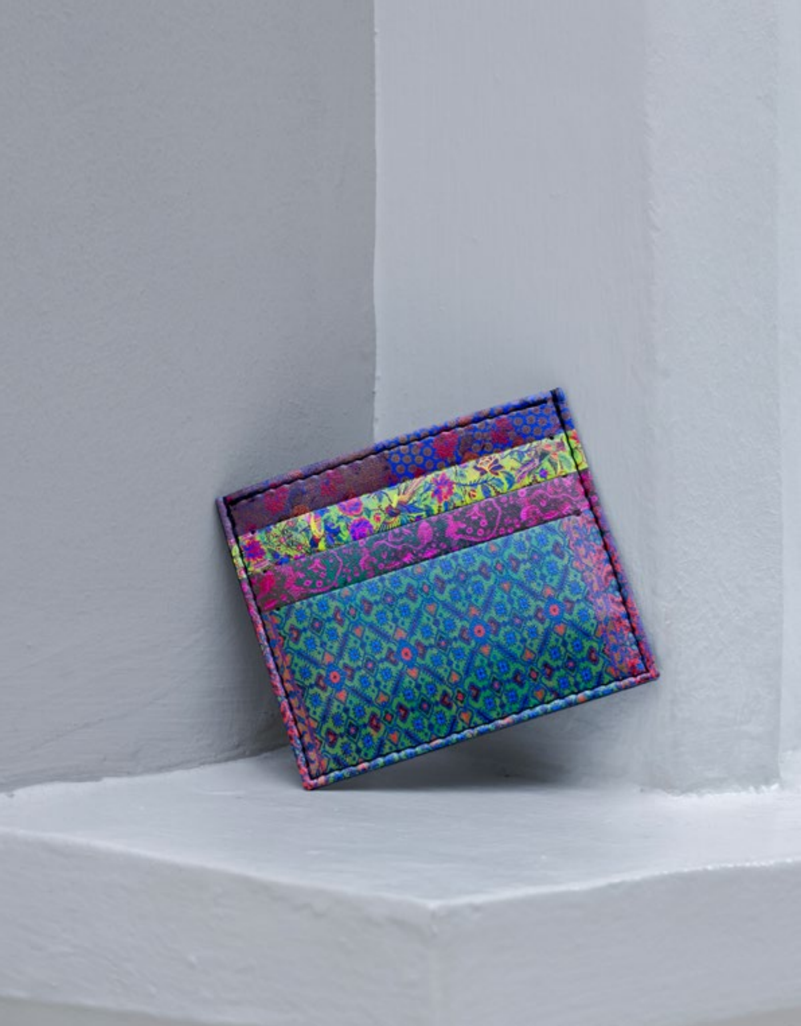
NATIONAL COLLECTION X MUSEUM MARTKET CARD HOLDER. MOTIFS TAKEN FROM SARONG, OEY KOK SING, PATOLA SARI WITH BOHRA GAJJJI WEAVE, BED HANGINGS AND SARONG.