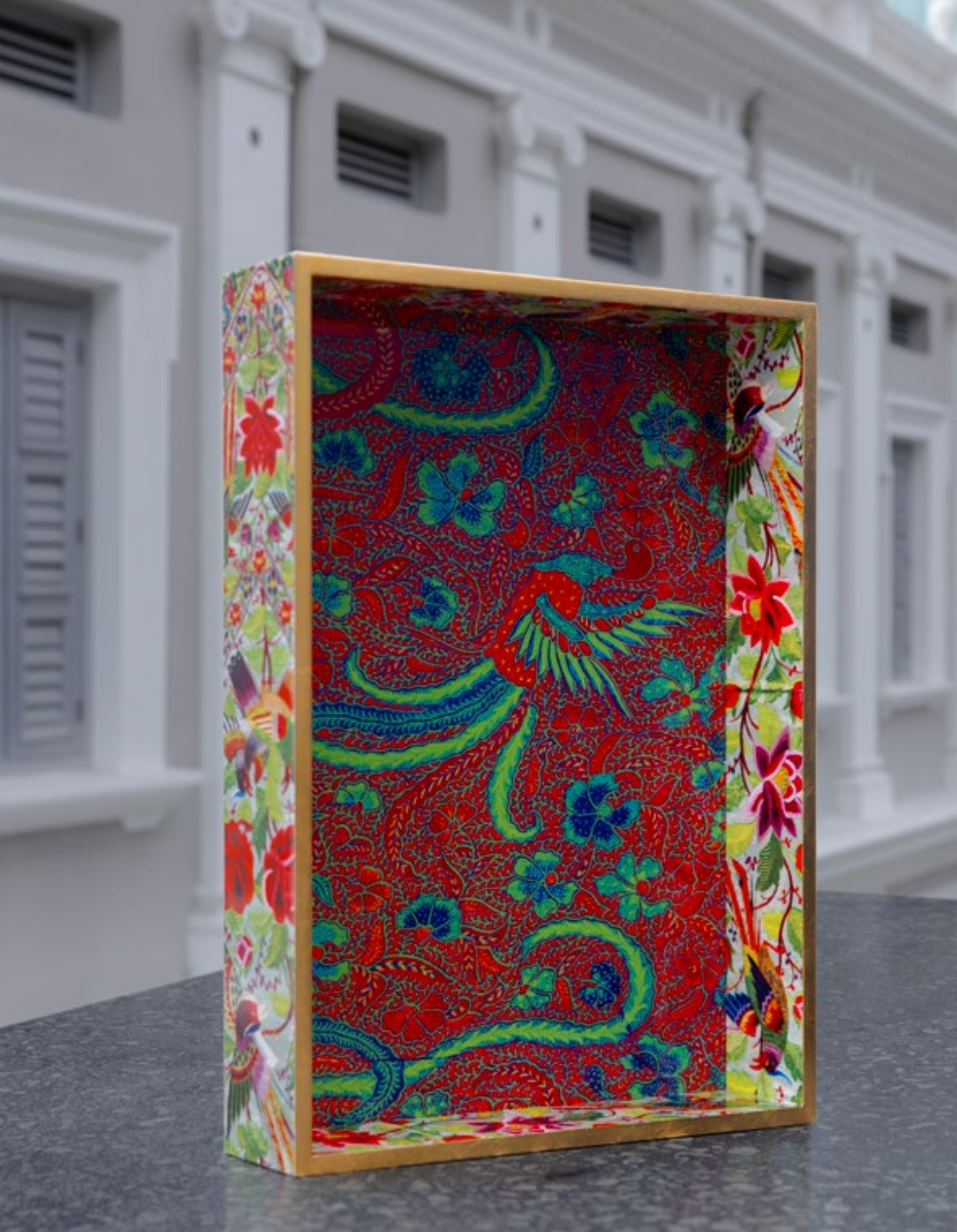
NATIONAL COLLECTION X MUSEUM MARTKET LACQUER TRAY. MOTIFS TAKEN FROM BED HANGINGS AND MALAY BATIK SARONG.