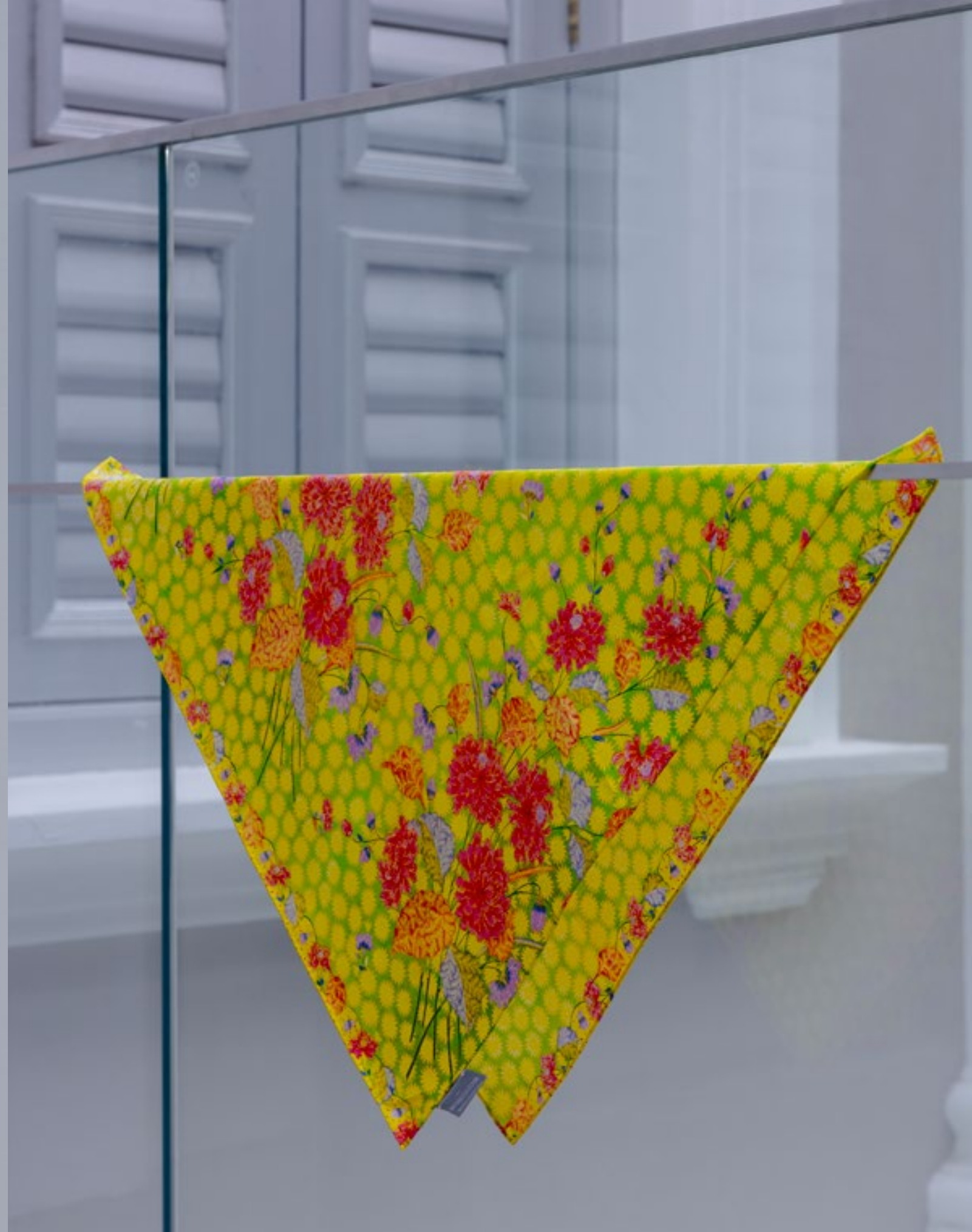
NATIONAL COLLECTION X MUSEUM MARTKET SILK SATIN HAND-ROLLED SCARF. MOTIFS TAKEN FROM SARONG, OEY KOK SING.