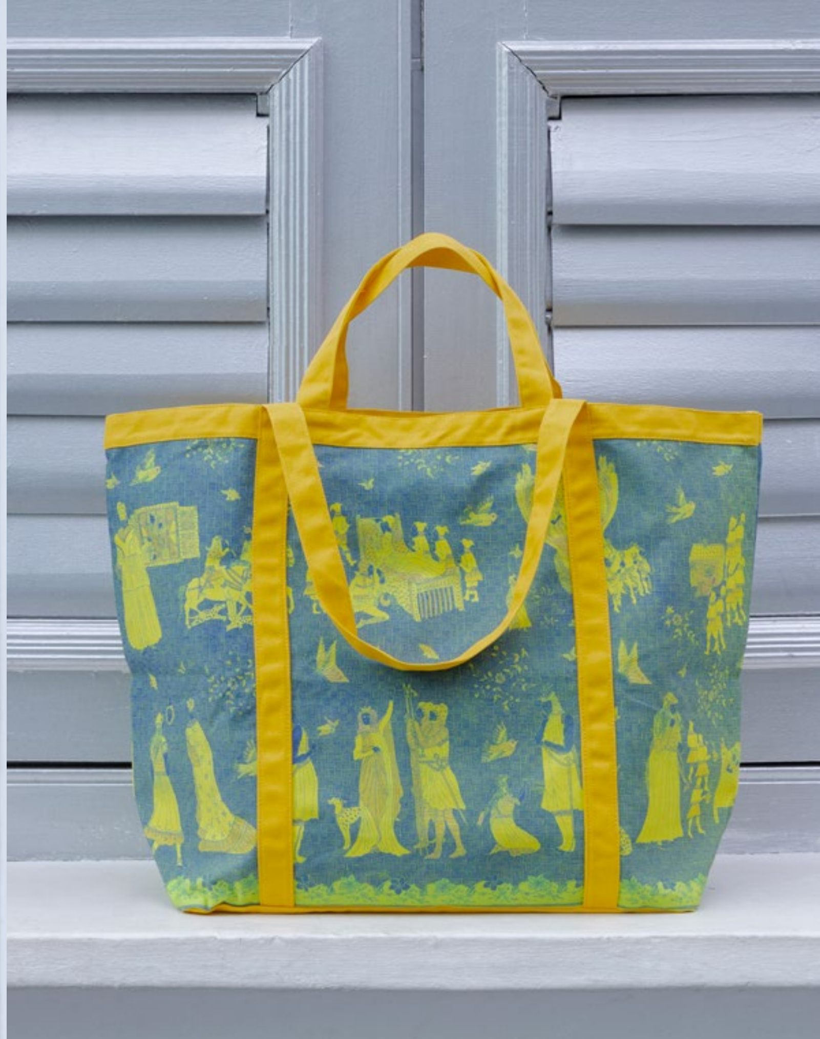
NATIONAL COLLECTION X MUSEUM MARTKET COTTON TOTE BAG. MOTIFS TAKEN FROM SARONG BY BATIK MAKER M.P. SOEDIRO.