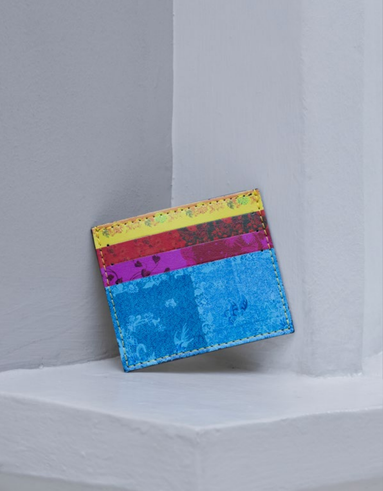
NATIONAL COLLECTION X MUSEUM MARTKET CARD HOLDER. MOTIFS TAKEN FROM SKIRT CLOTH (KAIN PANJANG) THE TIE SIET, AND DIFFERENT SARONGS.