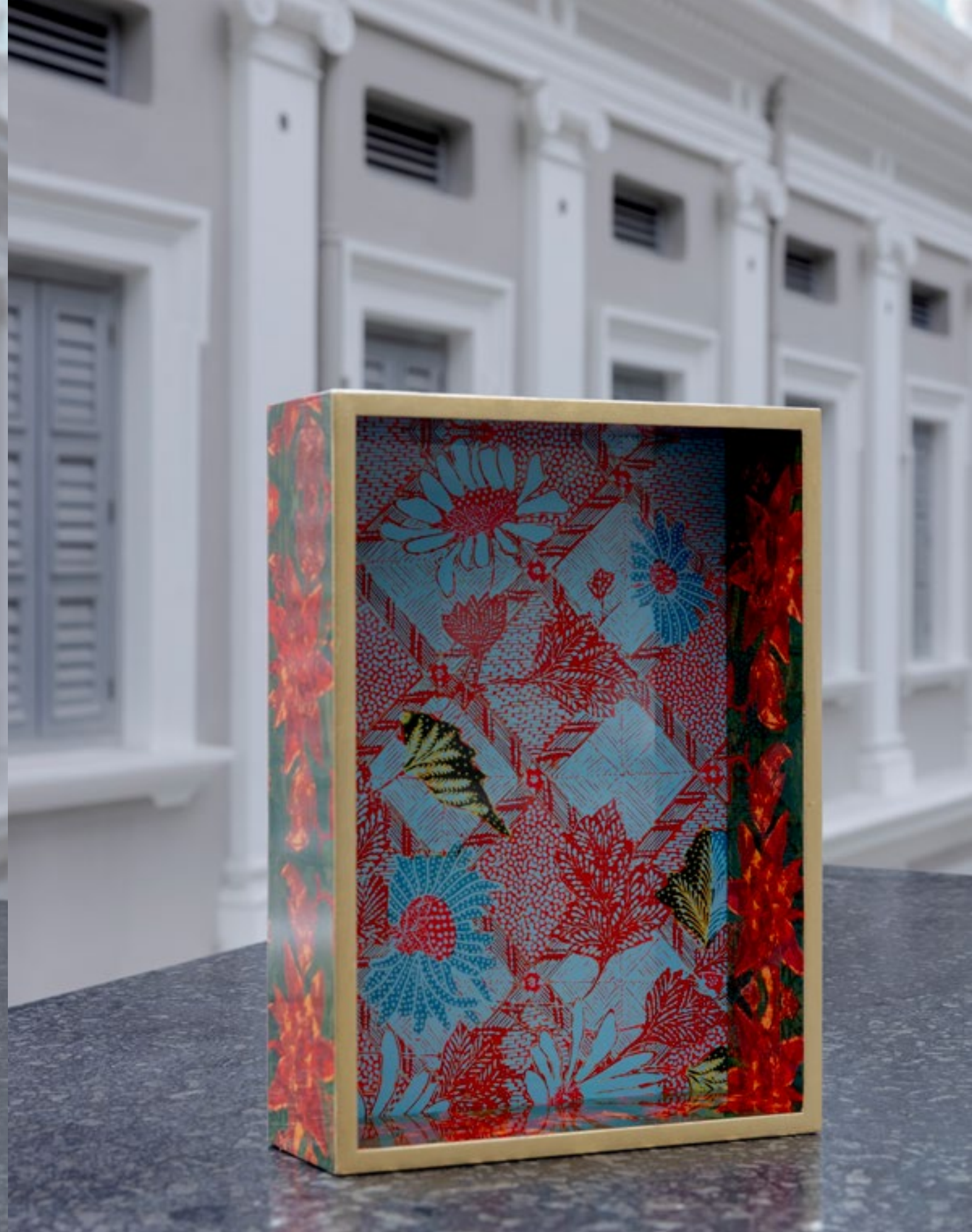
NATIONAL COLLECTION X MUSEUM MARTKET LACQUER TRAY. MOTIFS TAKEN FROM SARONG AND LONG ROBE.