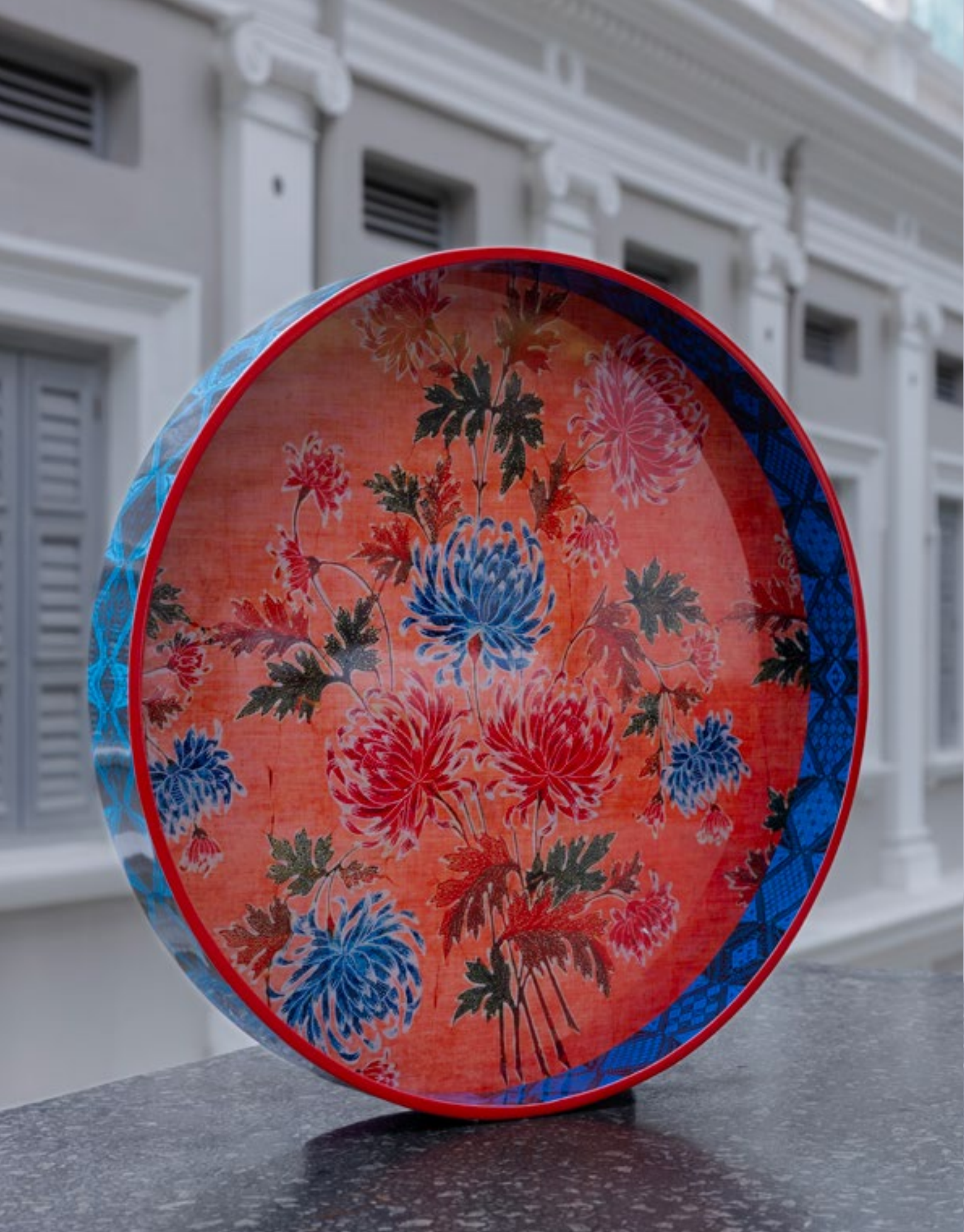
NATIONAL COLLECTION X MUSEUM MARTKET LACQUER TRAY. MOTIFS TAKEN FROM DIFFERENT SARONGS.