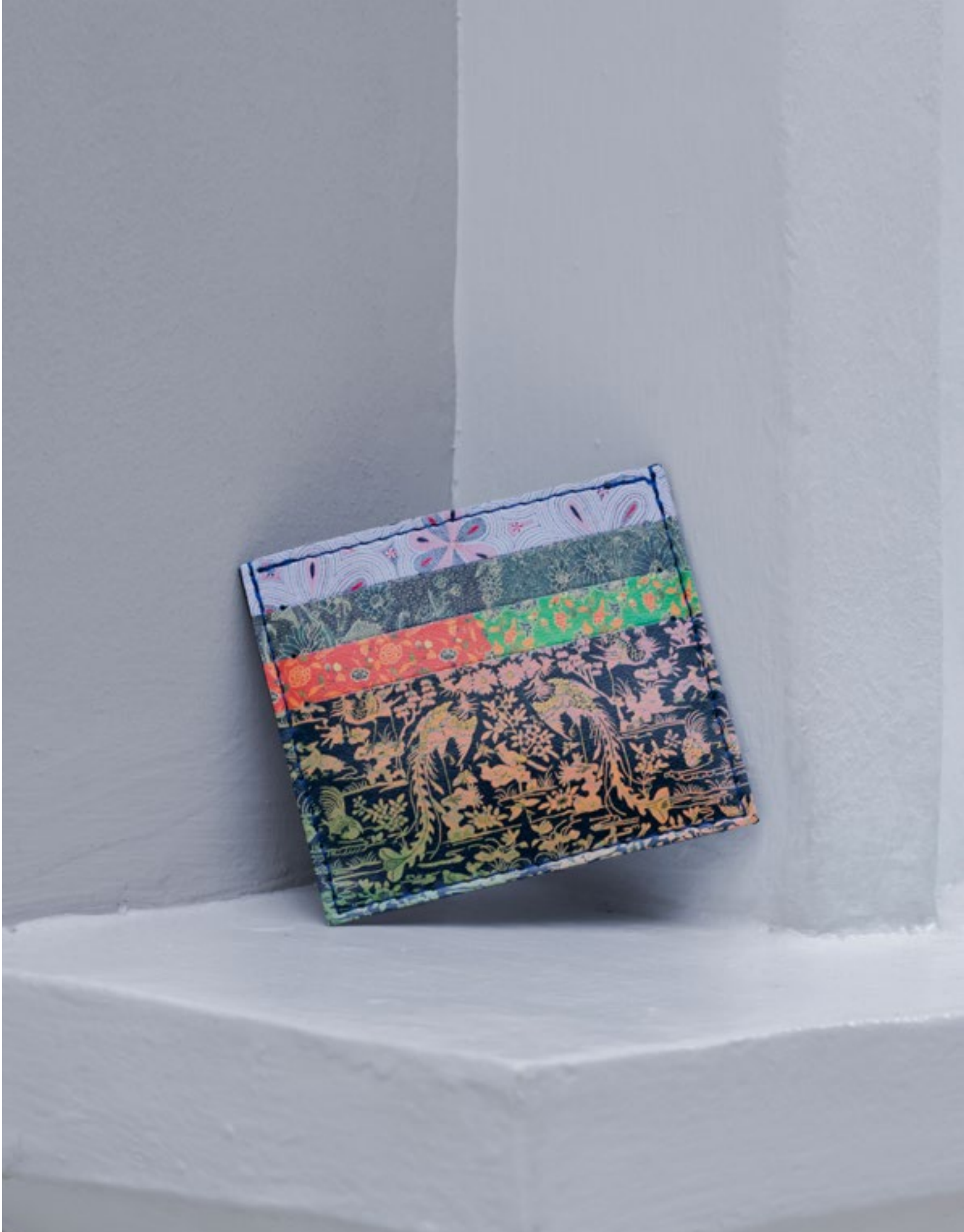
NATIONAL COLLECTION X MUSEUM MARTKET CARD HOLDER. MOTIFS TAKEN FROM KANTHA EMBROIDERY WITH FLORAL MOTIFS, SKIRT CLOTH (KAIN PANJANG) THE TIE SIET, AN EXOTIC PARSI JHABLA (CHILD'S TUNIC) AND SARONG.