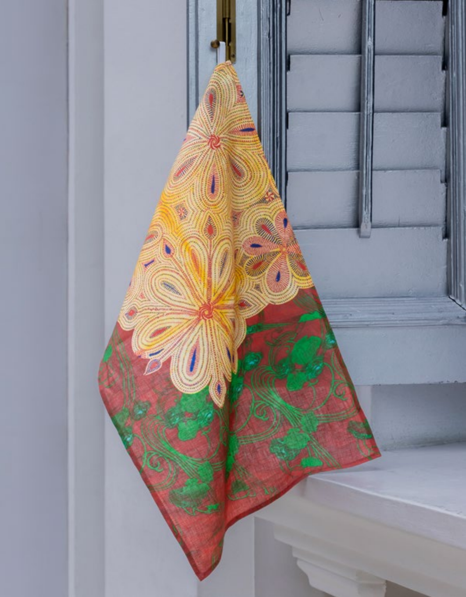
NATIONAL COLLECTION X MUSEUM MARTKET LINEN TEA TOWEL. MOTIFS TAKEN FROM KANTHA EMBROIDERY WITH FLOWER MOTIFS AND SARI.