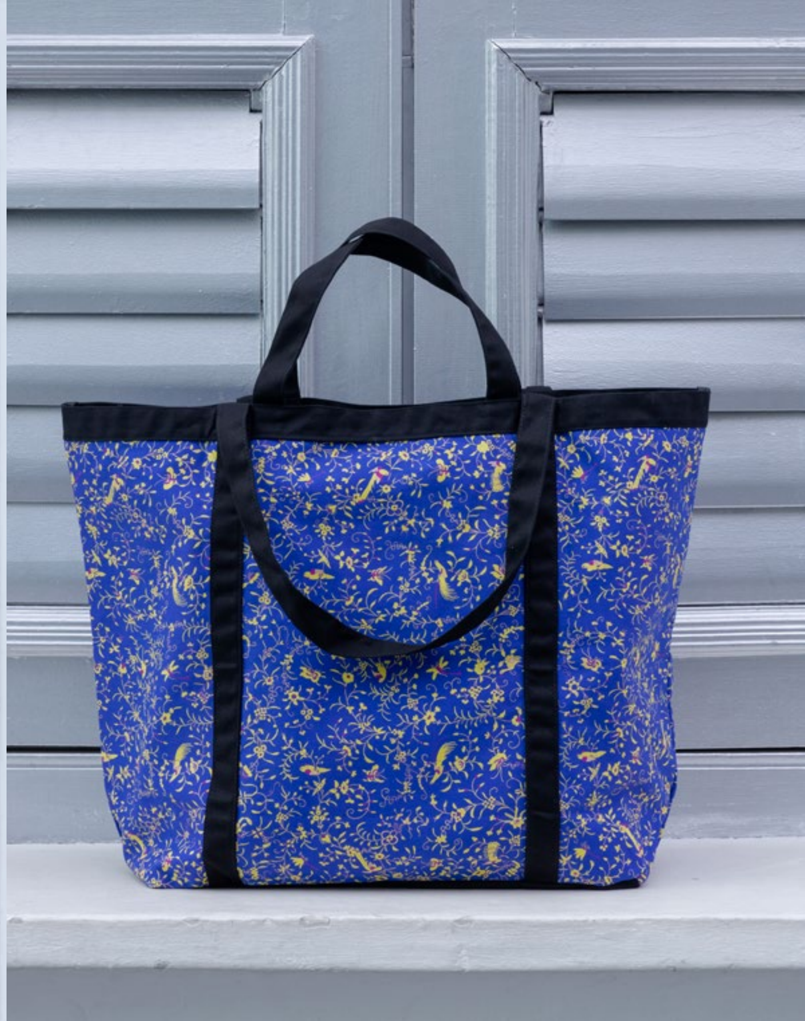
NATIONAL COLLECTION X MUSEUM MARTKET COTTON TOTE BAG. MOTIFS TAKEN FROM SARI.