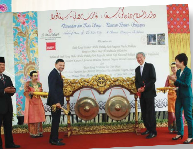
The exhibition was opened by His Royal Highness Prince Haji Al-Muhtadee Billah ibni His Majesty Sultan Haji Hassanal Bolkiah Mu'izzaddin Waddaulah and Deputy Prime Minister Teo Chee Hean.