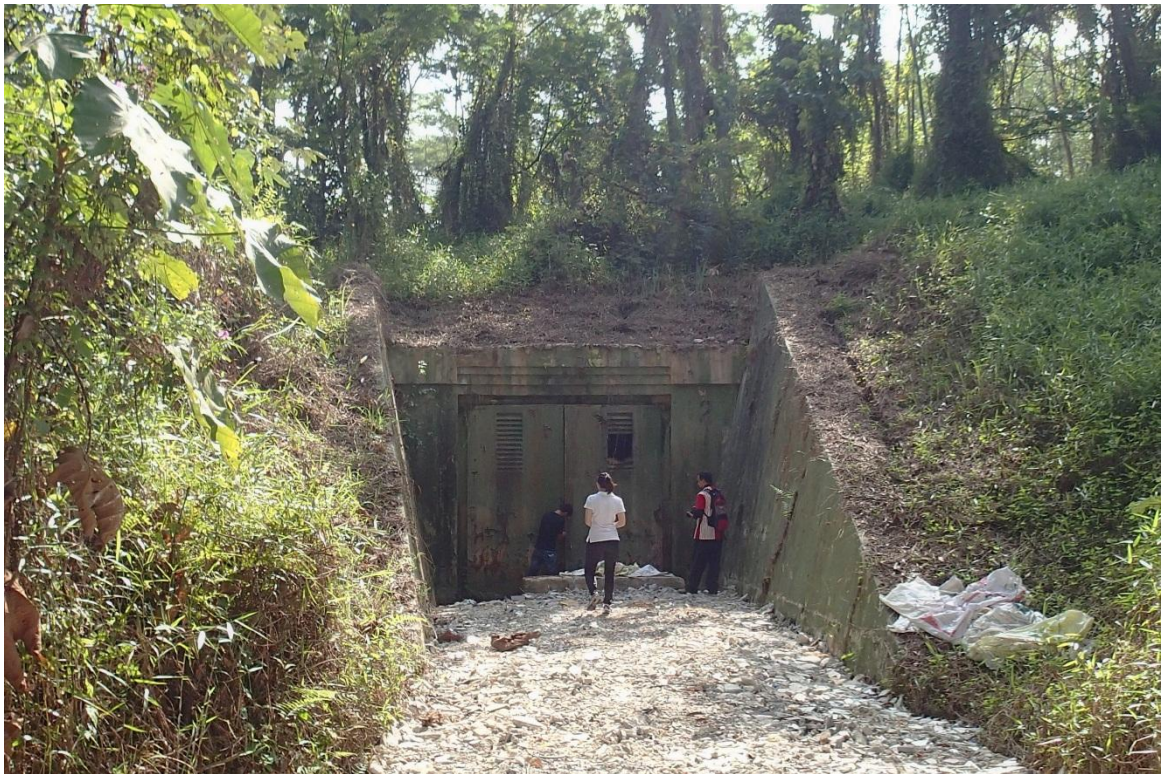
Photograph 1: Entrance to the Attap Valley Bunker