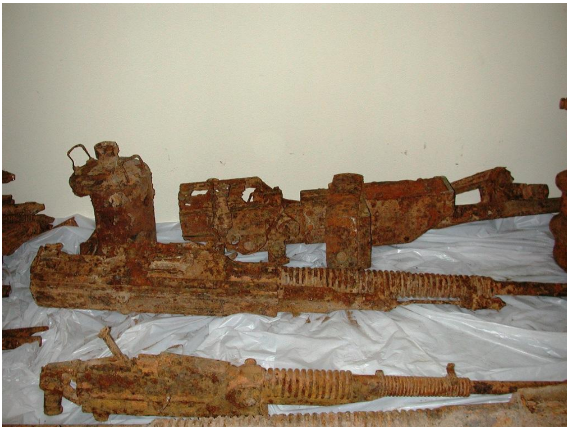
Photograph 1: Japanese machine guns used in WWII, which will be on display in the exhibition

Through the use of photographs, WWII artefacts, court transcripts and video clips, the exhibition will present key cases covering war crimes committed at Alexandra Hospital, Selarang Barracks, Oxley Rise, Outram Goal, Arab Street and on board the Hofuku Maru , as well as during Sook Ching, Double Tenth, and Operations Jaywick and Rimau.