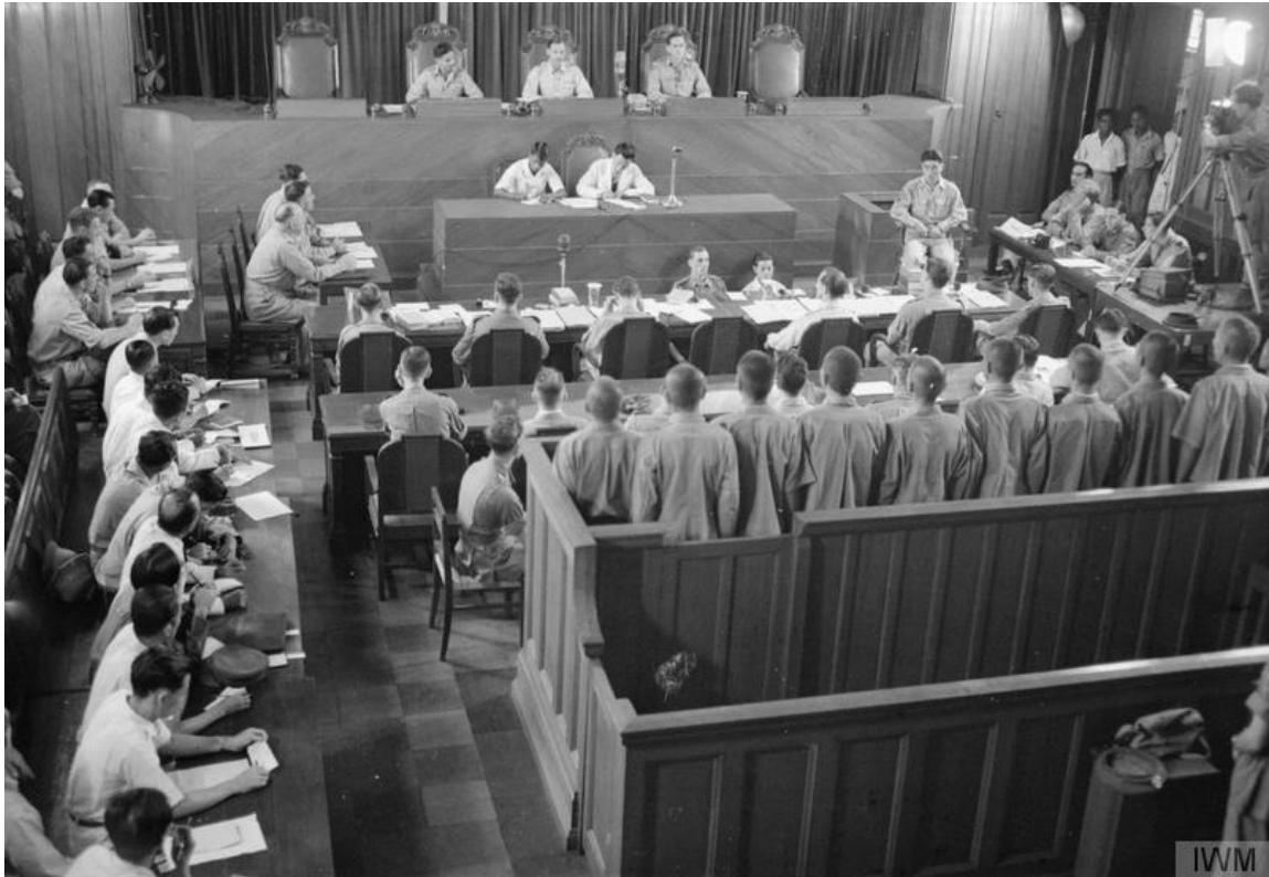
Photograph 2: Indicted Japanese war criminals standing to attention in the dock of the Singapore Supreme Court at the beginning of the trial. This photograph will be incorporated as part of the exhibition.