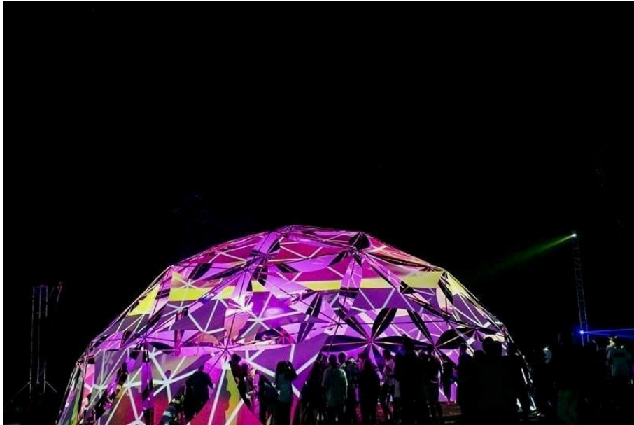
Artist's impression courtesy of Starlight Alchemy

18 to 26 August 2017 | 7.30pm – 12 midnight