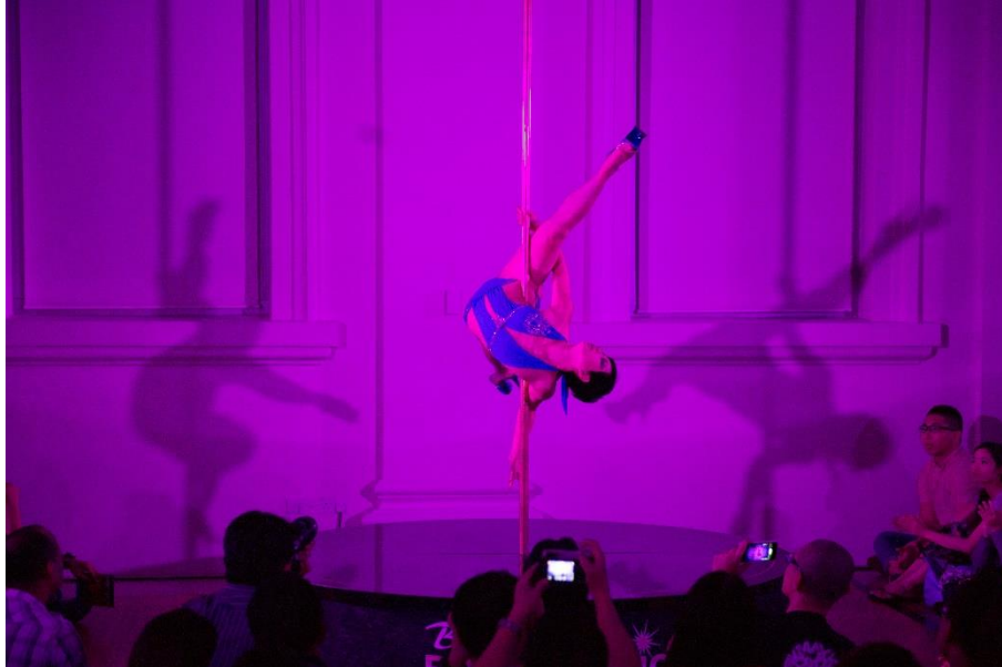
Bobbi's Pole Studio, 2014.

Get access to Singapore's premier pole dance studio and watch the students, instructors and a cancer survivor group, The Rose Diamonds, demonstrate the power and elegance of the human body and re-establish pole dancing as an athletic art form.