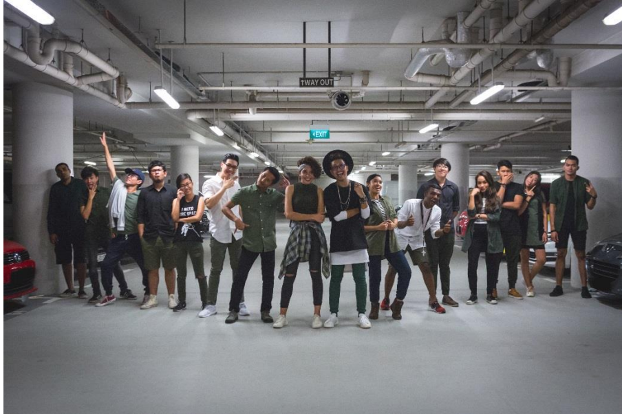
MOTUS. Image courtesy of HOMEMADE

An amalgamation of vocalists, instrumentalists and a bateria (likened to a “drum kit” in Portuguese and Spanish) is MOTUS’ recipe to fusing Samba and mainstream music. Whether you’re a feet tapper, head bobber or a full on dancer, our aim is to get you moving.