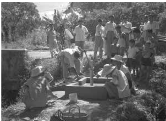
Workers installing a water standpipe in Jurong in 1959.

"I was living in Tuas and my school was in Bukit Timah. I had to wake up at 5am just so that I could get to school on time. There (was) no proper transportation then and I had to cycle to and from school."