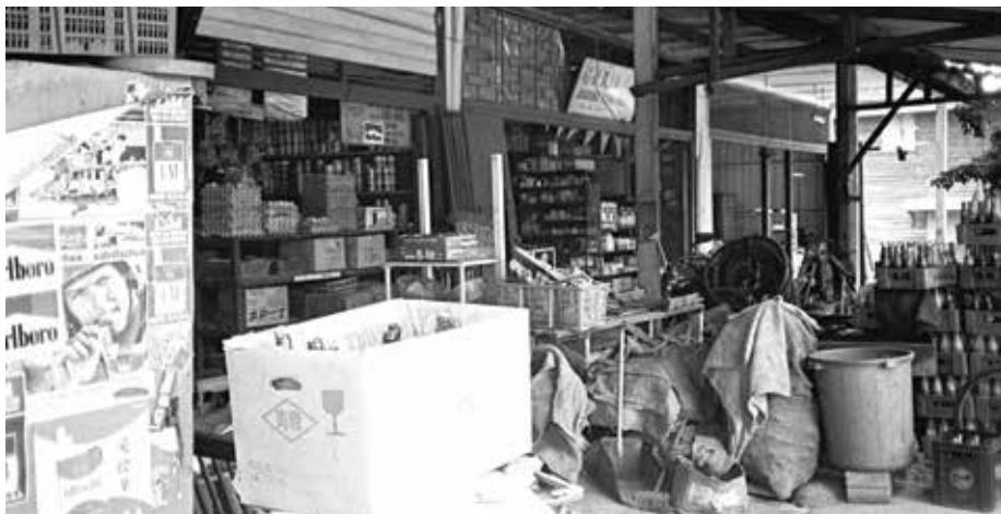
Provision shop along Jurong Road, 1986.

"Hawkers also sold those things that children like to eat, like biscuits or fruits, all sorts. More people bought you zha kueh (dough fritters), seldom roti (bread). In the past, (not many) people ate roti, now all of us Singaporeans eat it. In the past roti was eaten by Indians or westerners, people like us from China very seldom eat it."