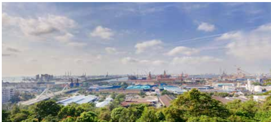
Jurong Port, Shipyards and Jurong Island in the distance.

Jurong Port stands on what used to be Kampong Pulau Damar Darat, Kampong Tanjong Balai and Pulau Damar Laut, to the east of the mouth of the Sungei Jurong. In 1963, wharves were constructed here by the Economic Development Board (EDB) to allow raw materials to be shipped in and finished products to be shipped out from the factories of Jurong.