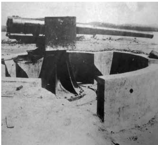
Pasir Laba Battery before the war, 1930s.

Following Singapore's independence in 1965, the new nation needed to establish a formal training structure for officers to lead its armed forces. Existing regiments and battalions such as the First Singapore Infantry Regiment (1 SIR) had been led by Malaysians or British officers. The camp chosen to house the new Singapore Armed Forces Training Institute (SAFTI) was Pasir Laba Camp, in the western reaches of Jurong near the intersection of Upper Jurong Road and Pasir Laba Road.