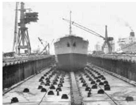
Jurong Shipyard, 1960s.

In the 1960s, part of the government's economic strategy involved making Singapore a major player in shipping, shipbuilding and repair, second only perhaps to the Asian leader Japan. The ship repair facilities at the Singapore Harbour Board dockyard in Keppel Harbour