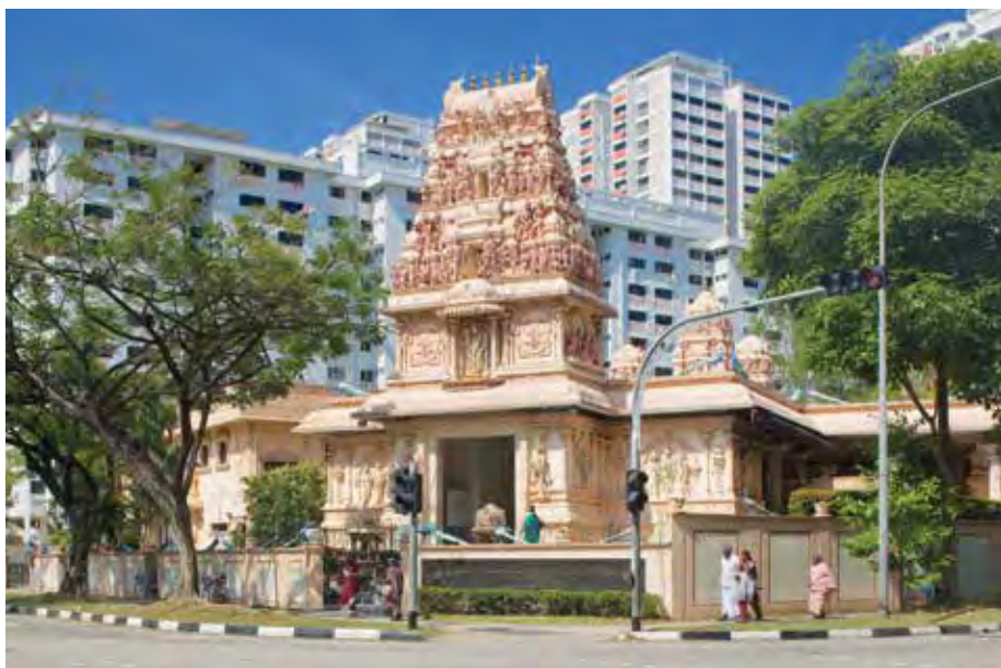
Arulmigu Murugan Temple.

This is the only Hindu temple in Singapore to feature a yagasalai , a permanent fixture for prayers involving the use of fire. These prayers are performed for between 10 to 12 days each month. The Arulmigu Murugan Temple also distributes food to the needy on the last Saturday of each month and conducts religious classes for hymn recitals.