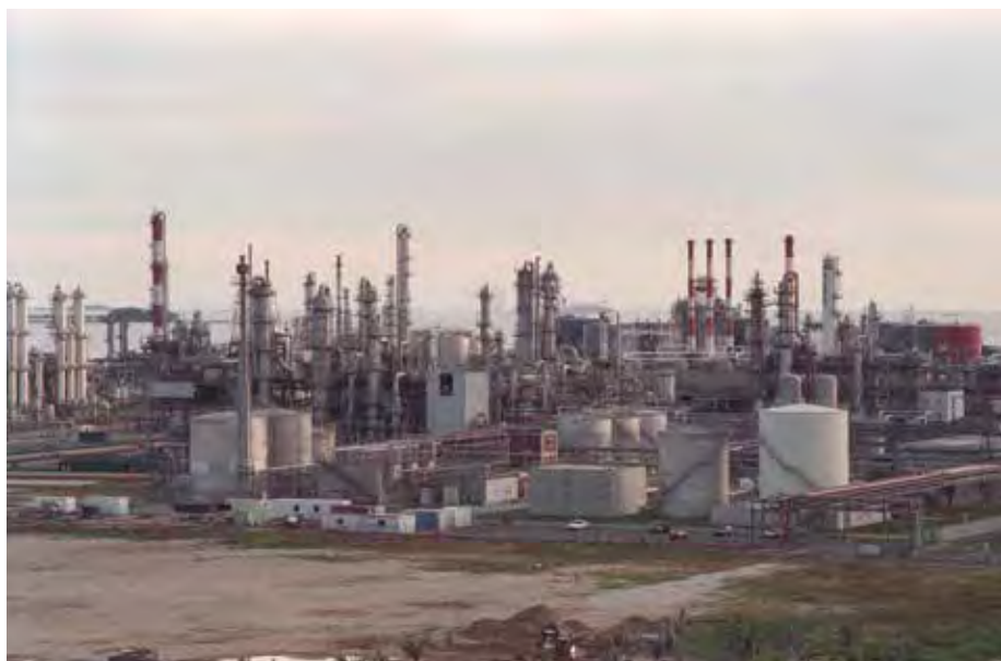
Oil refineries at Jurong Island, officially opened in 2000.

Rare marine flora has also been found in lagoons on Semakau, including the giant Neptune's Cup Sponge, a species previously thought extinct worldwide before its rediscovery in 2011 near St John's Island. Neptune's Cup Sponges can grow more than a meter in diameter and height, and in the past were coveted by collectors and used as tubs for babies. Semakau is open to the public for selected recreational activities.