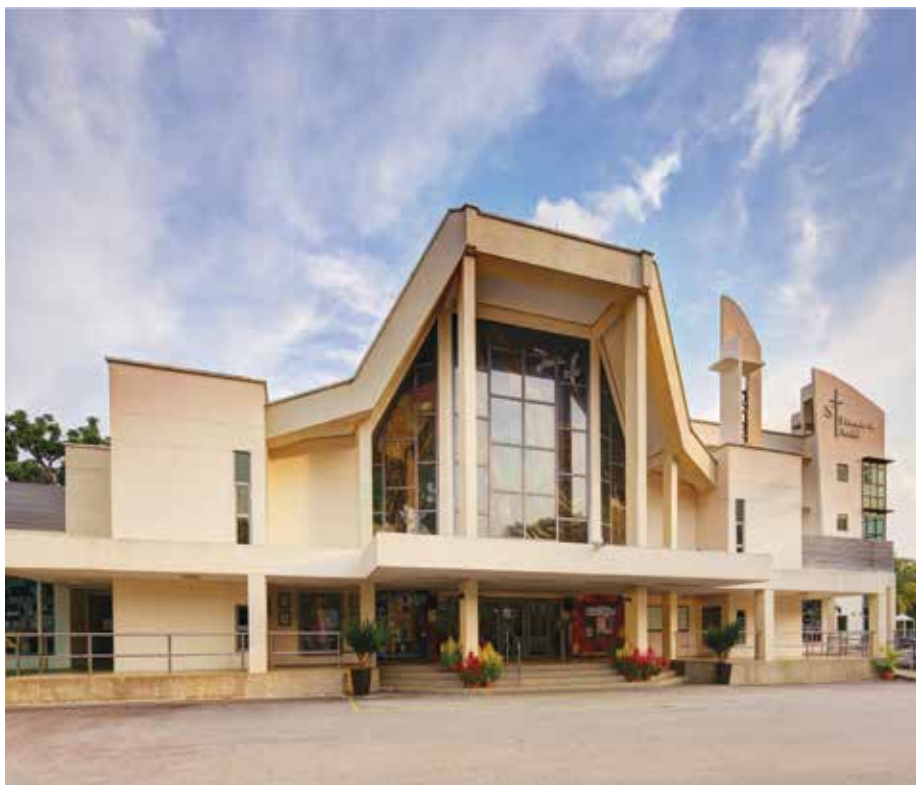
Church of St Francis of Assisi.