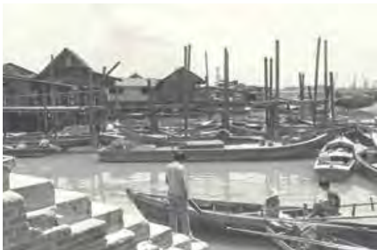
Tuas Village in Jurong, 1978.

The fishing industry has long featured in the Jurong story, from the Orang Laut and