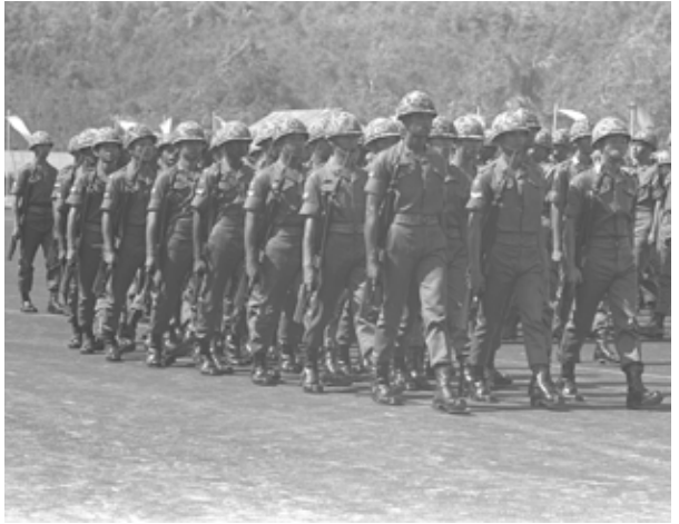
March-past of the first batch of 117 officer cadets at SAFTI, 1967.

A number of industrial facilities built in the 1960s and 1970s have become integral facets of Jurong's identity, even if some of them are