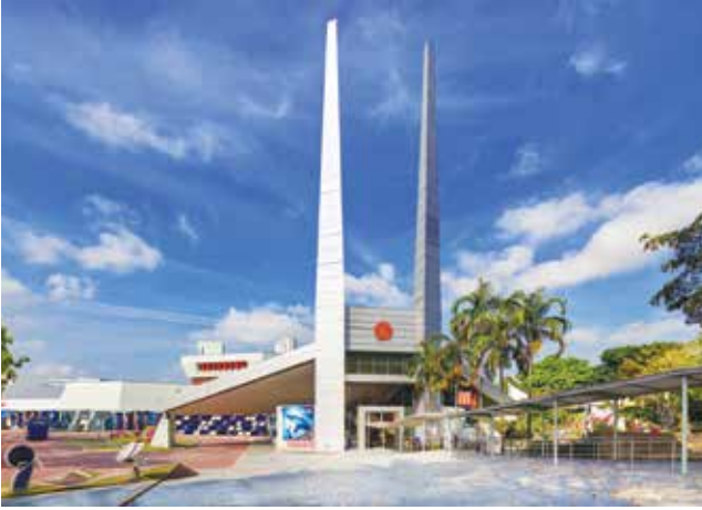
The Science Centre Singapore.

former Minister for Science and Technology, the Science Centre Singapore became the first public education and exhibition institution of its sort in Singapore. It was also one of the first of such facilities in Asia. The Science Centre Singapore aimed to showcase exhibitions on the physical, life and applied sciences, technology and industry, thereby promoting and inculcating a love for scientific learning.