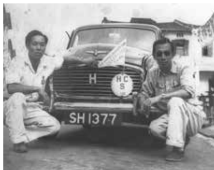
Taxi Drivers raising funds for Nanyang University, 1950.