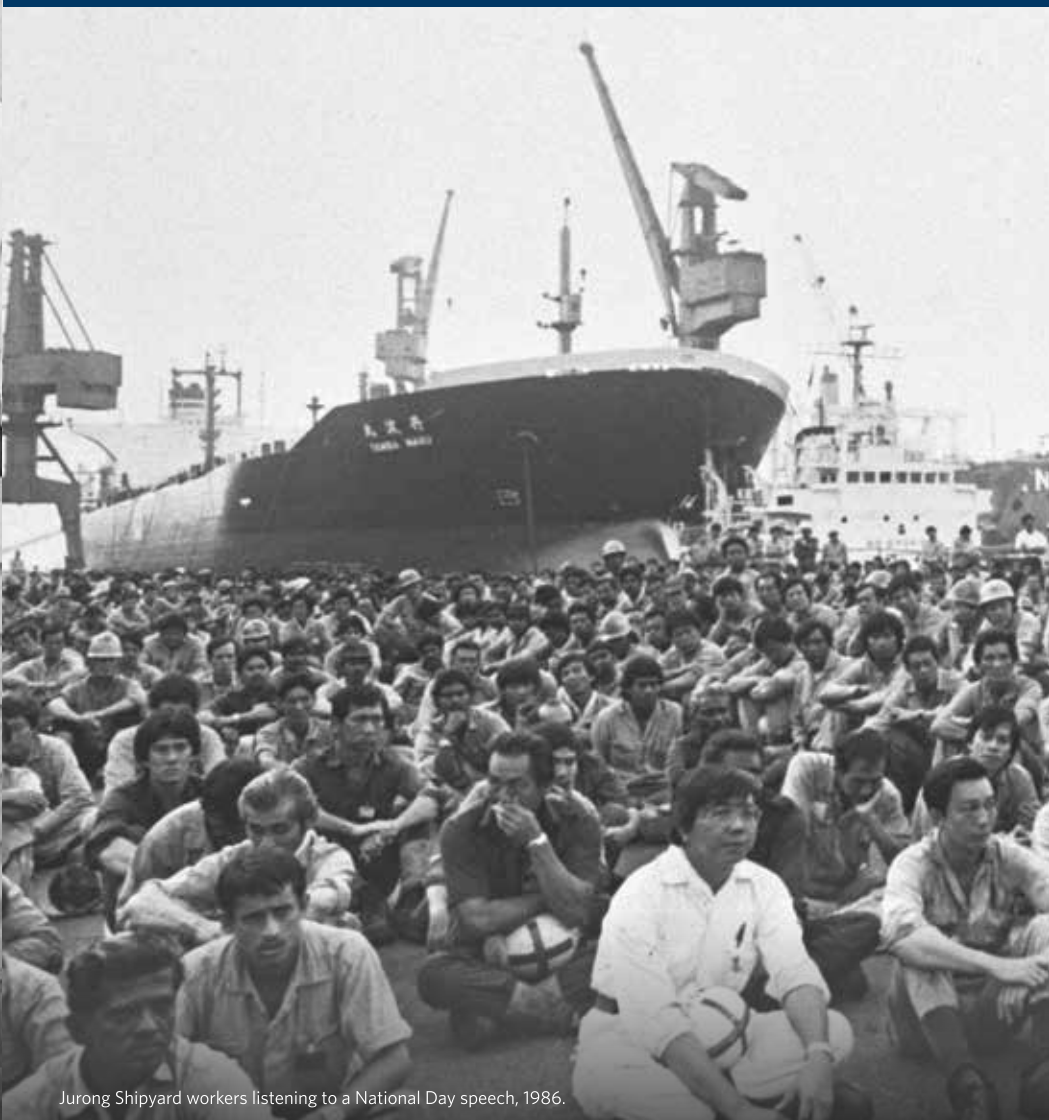
Jurong Shipyard workers listening to a National Day speech, 1986.