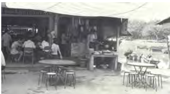
Small cluster of coffeeshops, shophouses and seafood restaurants at the end of Tuas, near the sea, 1978.