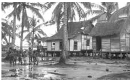
Kampong at Tanjong Balai, 1956.