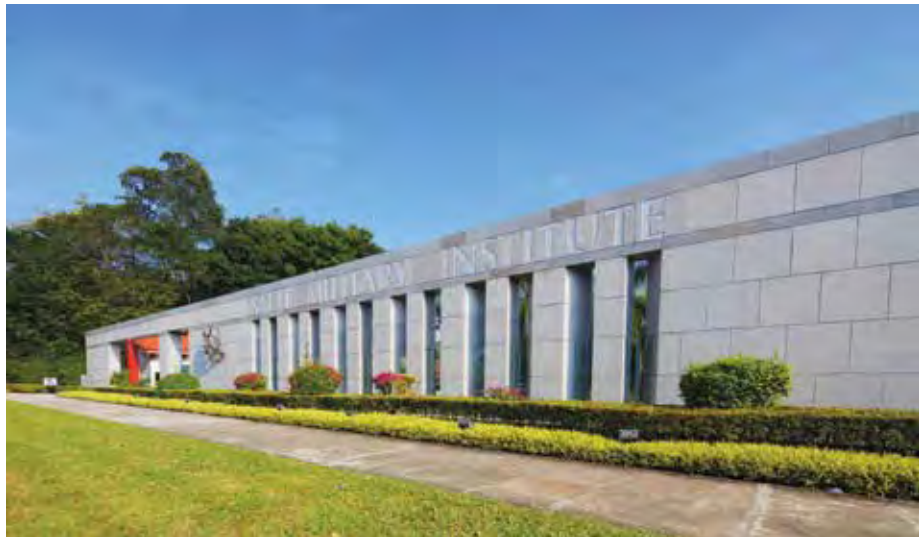
Present-day SAFTI MI.

The first Instructors' Preparatory Course commenced on 15 February 1966 at the temporarily empty Jurong Town Primary School. With Pasir Laba chosen over Pulau Ubin and Pulau Tekong, the first intake of Officer Cadets began training on 1 June 1966 at Pasir Laba Camp, while permanent facilities were being built.