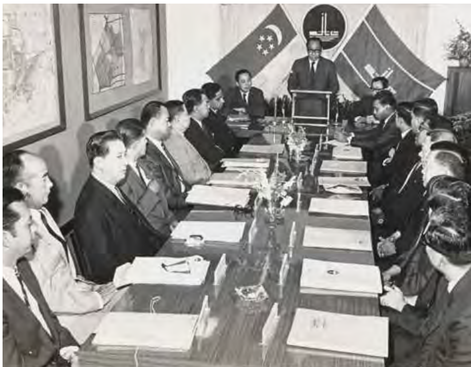
Then Minister for Finance Dr Goh Keng Swee addressing the inaugural Jurong Town Corporation (JTC) Board meeting in June, 1968.