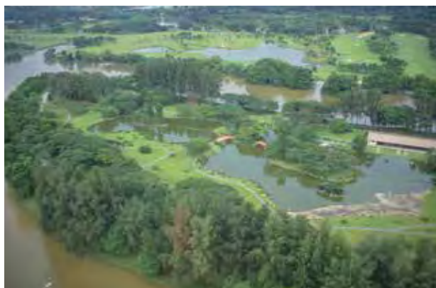
The Jurong Lake area. Green spaces were planned to make Jurong attractive to reside in.

total, was slated for parks, gardens and other green spaces. The natural heritage of Jurong was also considered, with the upper Sungei Jurong area demarcated as a buffer zone between the industrial and residential areas. Tracts of trees, shrubbery and grass field also separated the two areas. These efforts added a green aspect to the industrial character of Jurong, while also preserving a slice of the area's natural heritage.