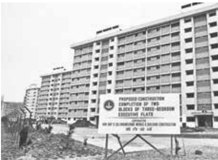
Three-room executive flats under construction in Jurong, 1973.

"A big problem then was getting people to work in Jurong. We spoke to a local businessman once and he asked us: 'Do you know where we play football? We play at the Padang, in front of City Hall. To go even there, people complain that it is too far.' What more Jurong, with no housing or amenities? Forget about it. If we could not attract workers, we could not attract investors."