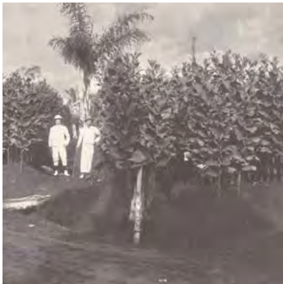
A gambier and pepper plantation, 1900s.

The pattern of land clearance, crop cultivation and settlement evolved into the kangchu system in Singapore, Johor and other parts of Malaya. The kangchus (literally 'lord of the river' in Teochew) were Chinese headmen who organised labour, supplies, capital and the transport to markets.