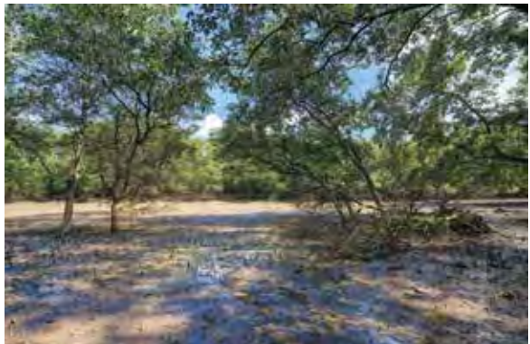
A stretch of mangroves at the mouth of Sungei Pandan today.

The mangrove fringes still retain a marvellous diversity of flora and fauna, and visitors can spot and hear birds such as grey herons, striated herons, pied fantails, ashy tailorbirds, Asian paradise flycatchers and white-bellied sea eagles. In and between the mangroves and nipah palms, the keen-eyed can pick out mud lobsters, mudskippers, tree lizards, horseshoe crabs and dog-faced water snakes.