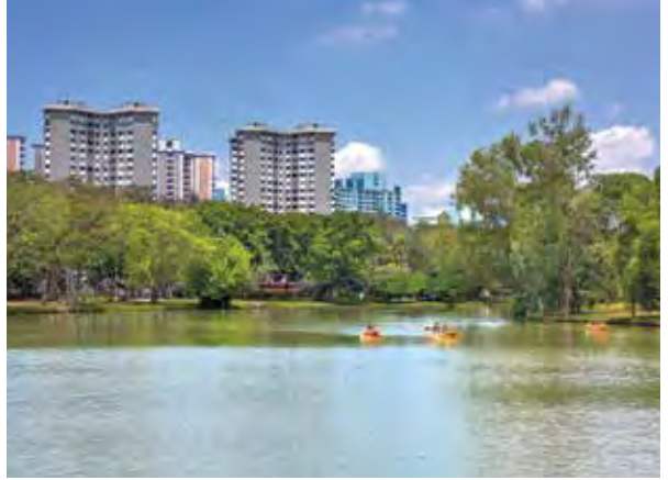
Kayaking activities at the Jurong Lake.

During the development of the industrial town in the 1960s, EDB planners decided to convert the Sungei Jurong into a lake, rendering it easier to provide water for industrial purposes and create social and leisure amenities around the water. The upper section of the river was dammed in 1971, creating Jurong Lake. Rainfall in Jurong East and Jurong West is now channelled to the lake via canals and drains, turning it into a reservoir.