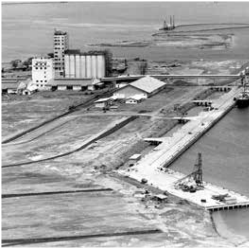
Railway lines leading to the wharves in Jurong, 1960s.

As the production of the Jurong Industrial Estate grew steadily from the late 1960s, planners sought another option besides Jurong Port for the transport of raw materials and the export of finished products. Their gaze turned north and the EDB worked with Keretapi Tanah Melayu (KTM, Malayan Railways Limited) to develop Jurong Railway at a cost of S$5.9m. The Jurong line branched off from the main Malaysia-Singapore railway, and was the first new line built by KTM since World War II.