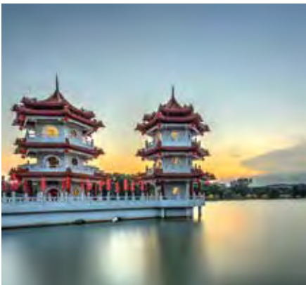
The Chinese Garden at sunset.

For more on the recreational activities such as fishing available at Jurong Lake, as well as the natural heritage of the area, please visit http://www.abcwaterslearningtrails.sg/web/jurong-lake.php .