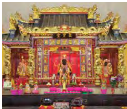
The prayer hall of the Tuas Tua Pek Kong Temple.

Home to Chinese and Malay fishermen, Tuas Village was one of the earliest settlements in the area having been founded on the banks of the Sungei Tuas in the 1880s. Fishermen here used traditional net fishing methods, with the name of the village derived from the Malay word menuas or hauling up a net. At its peak, hundreds of boats plied the waters between western Singapore and Indonesia, bringing their catch to Tuas or Pasir Panjang.