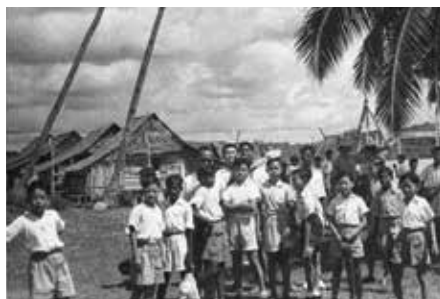
Students on an excursion at Tanjong Kling, 1951.

Tanjong Balai was in 1931 "a kampong of some 40 people, with no access to Singapore other than the sea", while Pulau Damar Darat held "about 50 Malays whose children have to row in kolehs (boats) to get to school."