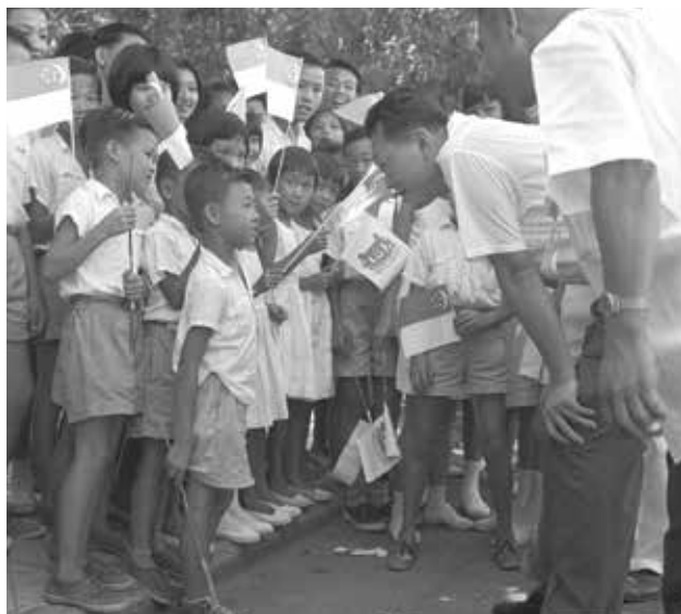
Prime Minister Lee Kuan Yew greeting school children at Jurong Road during his tour of the area in 1962.