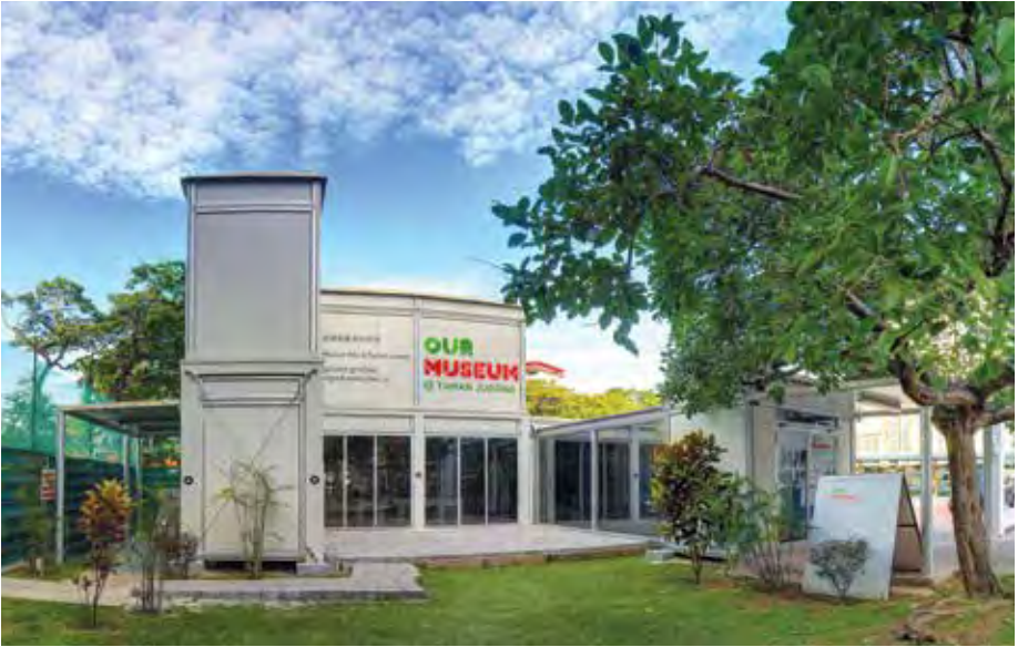
The Museum by day.

We end our trail of Jurong with the first community museum in Singapore, Our Museum @ Taman Jurong, a vibrant space for community memories, heritage and art. Elements of Jurong's history and culture feature prominently in its exhibitions.