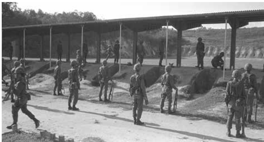
Training session at SAFTI, Pasir Laba Camp in Jurong, 1971.