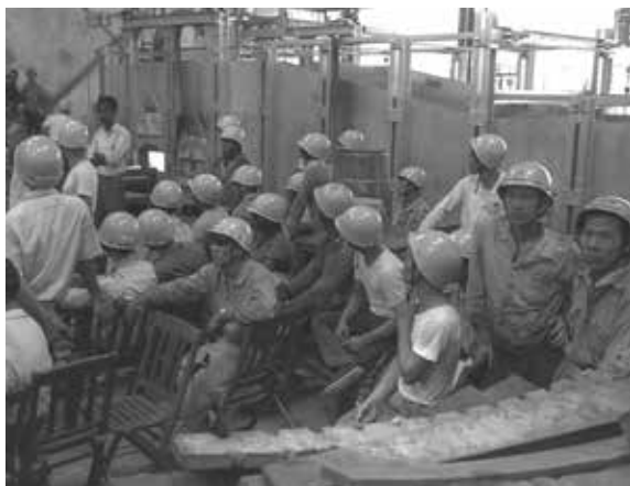
Workers of Jurong Industrial Estate, 1963.