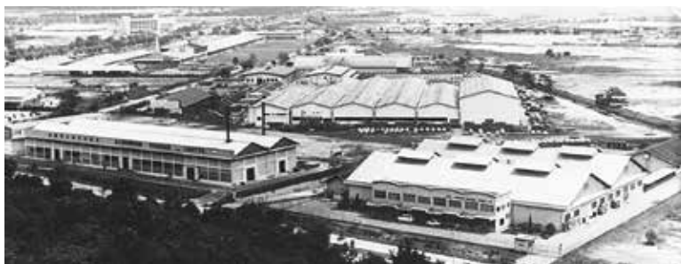
Factories stand where swamps once were, 1960s.

Such was the need for investors to take a chance on Jurong that Dr Goh and the EDB left nothing to chance. To stoke a mood of buoyancy and a sense that Jurong was 'open for business', Dr Goh directed the EDB to arrange for him to open several factories each week and ensure wide media coverage for each.