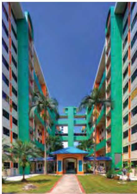
The now iconic 'H'-blocks at Boon Lay Gardens were some of the early residential units built in Jurong.

At the planning stage, some 580ha of land, or 12% of the