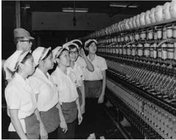
Female workers of Singapore Woodlands Spinning Mill.

"I still remember the early seventies when we (worked in) the factories. When we worked the night shift we would go to the hawker centre buy food we liked (and bring it) to the factories (for our) working colleagues. When we stayed in the (company) hostel, we were very close, you know. (Until today) I can really remember these people, even those who came from Malaysia. I learned the Malay language (as) we worked in the factories, and (my Malay colleagues) liked to invite (us) to their weddings, whether their relatives or whoever they will invite you."