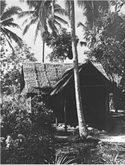
Attap roofed house on Jurong Road, 1950.

"There was a market here for a long time, before they built a permanent market in the 1960s. People would bring their vegetables, like kiam chye (salted vegetables) and chye sim (mustard greens), pigs, chickens and fish from the villages in Tuas to sell. There was also food like noodles and snacks like kua ci (winter melon seeds) and soon kueh (turnip dumplings)."