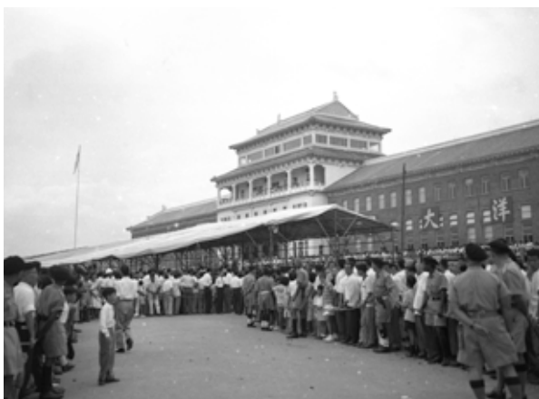
Opening of Nanyang University, 1958.