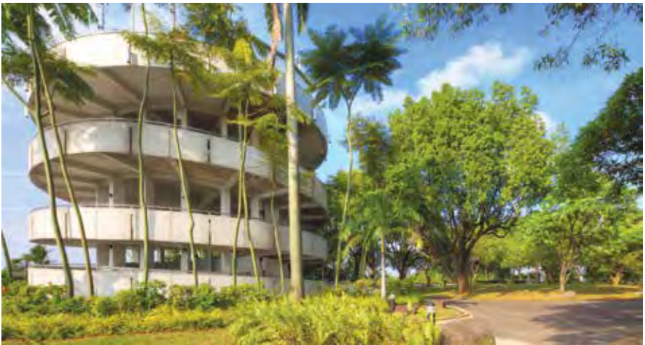
Jurong Hill remains as a green oasis amidst the industrial estate.

In 1968, the Jurong Town Corporation (JTC) converted Jurong Hill into a park with a sunken garden, miniature waterfall and streams. A spiralling Lookout Tower was opened in 1970 at the top of the hill, and many remember a Japanese teppanyaki restaurant here. The tower offered visitors panoramic views of Jurong as well as Malaysia and Indonesia in