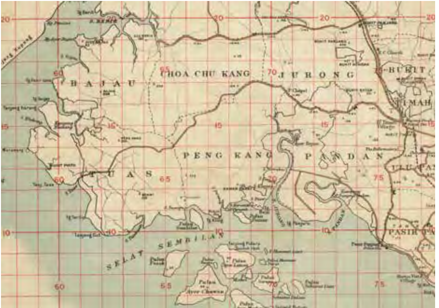
Jurong and its surrounding areas in a 1911 map of Singapore.

"Jurong, as I know, is bounded by Bukit Timah Road — so called seven miles (7th milestone). The extended road beyond 7 miles is called Jurong. From that road leading to the sea, and even to Pasir Laba, opposite Johor, is also called Jurong. Jurong encompasses a very broad boundary."