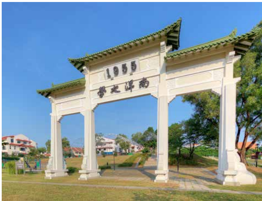
The Nanyang Gateway Arch.