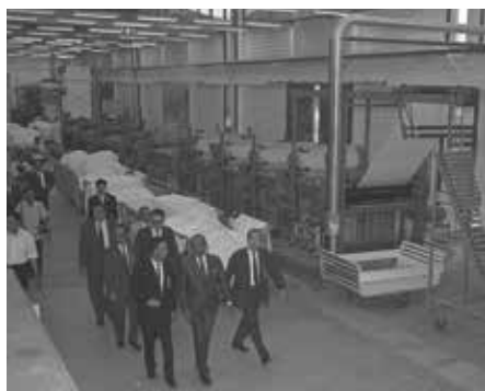
Then Minister for Foreign Affairs, Mr S Rajaratnam, toured the Singapore Textile Ltd at Jurong during its opening, 1969.

"All I saw in the area were clay mountains and mud tracks. NatSteel was at the furthest end, near the sea."