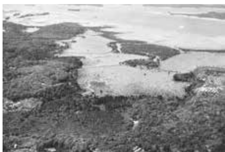
Jurong was an area of mangrove swamps and jungle.