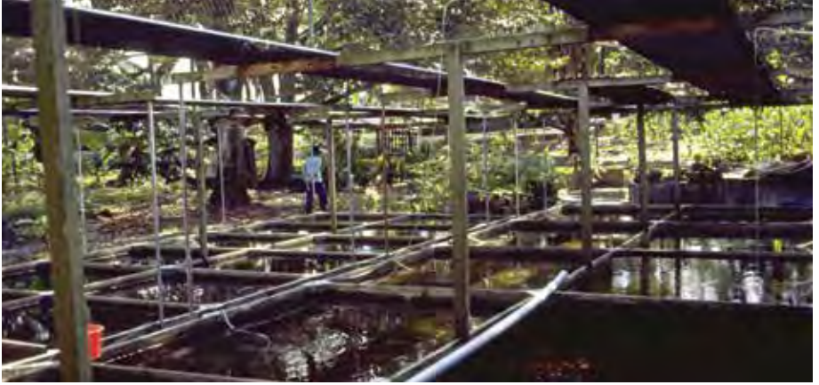
Small scale tropical ornamental fish farm in Hong Kah Village.