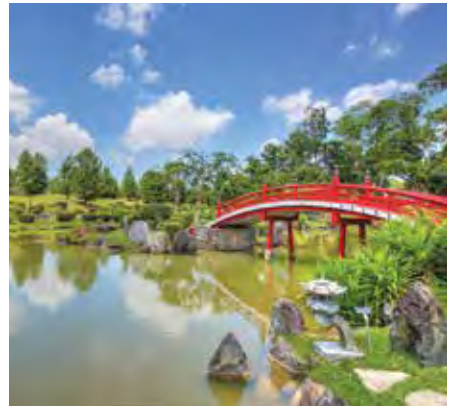
The Japanese Garden.

Designed by Taiwanese architect Professor Yu Yuen-Chen, the 11.3ha Chinese Garden (Yu Hua Yuan) was built between 1971 and 1975. Its design principles were based on classical northern Chinese imperial architecture, in particular the Song Dynasty period (960-1279). Its major features include ornate bridges, pavilions and a seven-storey pagoda, some of which were inspired by the Summer Palace in Beijing.