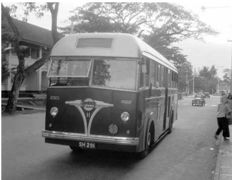
The 'green' bus, 1954.

In March 1941, the Singapore Traction Company began a bus route between Finlayson Green (now Raffles Place) and Jurong Road. This service ran every 20 minutes from 7am to 9.40am and from 4pm to 6.40pm on weekdays, and between 12pm and 3pm on Saturdays. This was the first direct bus service between Jurong and the town area. After World War II, the Jurong Omnibus Service was bought out by the Green Bus Company, which ran a service between Queen Street and the 18th milestone in Jurong between 1956 and 1971.