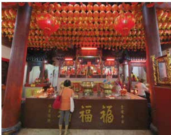
The interior of Tong Whye Temple.