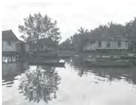
A fishing village in Jurong, 1956.