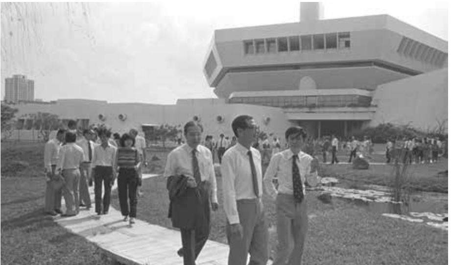
Then Minister for Environment, Mr Ong Pang Boon, toured the Science Centre's Eco Garden during its official opening, 1977.

In 1979, the International Council of Museums declared the Science Centre Singapore to be one of the top institutions of its kind in the world. Later additions to the centre have included the Omni-Theatre, Kinetic Garden, the Marquee (to host events and functions) and an Annexe Building for exhibitions and conferences.