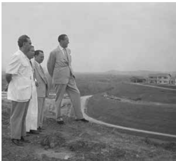
Chief Minister David Marshall, Tan Lark Sye and Colonial Secretary Alan Lennox-Boyd view the work in progress of Nanyang University in 1955.

of students in our secondary schools; every year the graduates add up to impressive numbers. In earlier times they were able to return to China for further studies, now it is not possible. Universiti Malaya has agreed to set up a Department of Chinese Studies, but to date there has been no tangible action...To preserve our Chinese culture, we need to set up a Chinese university."