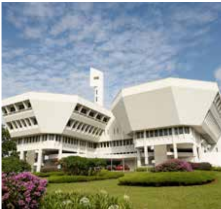
Jurong Town Hall today.

The late 1960s had seen the demands of managing the industrial estate in Jurong grow exponentially. It was decided that the Economic Development Board (EDB) should concentrate on economic promotion, wooing and engaging investors and helping finance projects. To manage Jurong and other industrial estates, the Jurong Town