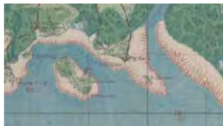
A 1945 map showing Tanjong Balai at the mouth of Jurong River.

By 1954, the Singapore Anti Tuberculosis Association (SATA) had raised enough funds to convert the hotel into a sanatorium for tuberculosis patients, some of whom were chronic sufferers of the disease, refused admission to government hospitals and left homeless. The SATA sanatorium was closed and demolished during the development of Jurong New Town in the late 1960s.