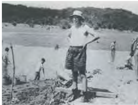
Prawn farmers at work in Jurong, 1960.

From the early 1900s, carp and prawn farmers carried out aquaculture in the rivers and water features of Jurong. Carp was introduced by the Chinese, who brought the practice from China, and involved five different species. Only the common carp was bred in Singapore, while the fry for the other species was obtained from China. The high-yielding carp farms were a popular food in Singapore, but gradually lost favour with fish farmers after World War II.