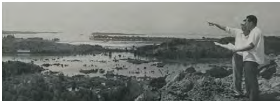
Prime Minister Lee Kuan Yew surveying the site which would become Jurong Industrial Estate with Economic Development Board Chairman Hon Sui Sen, 27 October 1962.

Even as the industrial estate was ready for production to begin in 1963, investors were voting with their money. In particular, local business leaders were generally more attuned to the mercantile trade and avoided investing in Jurong. In the early years, it was a struggle to convince investors to set up shop in Jurong, which would be the case until after 1967. Dr Goh spoke of the perception many had of Singapore's attempt to industrialise on a major scale: