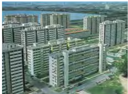
Teban Gardens was the third residential estate built by JTC, 1977.