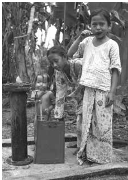
Young villagers brushing their teeth using a water standpipe.

One of the first villages with a significant Ann Kway population was Hong Kah Village, also notable for its establishment in the early 1800s by Chinese Christians. The name of the village