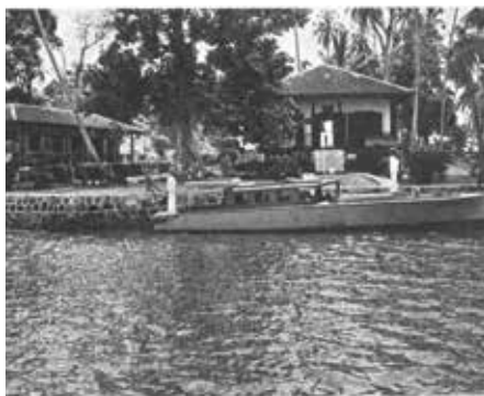
The Tanjong Kling police station, 1930.

Tuas Village was located at the 18th milestone of Jurong Road, in today's Pioneer area, with Sungei Tuas, Sungei Che Mat Gun and Tanjong Tuas nearby. The village was said to have been founded in the 1880s, with gambier planter Zheng Wan Bao among the pioneers.