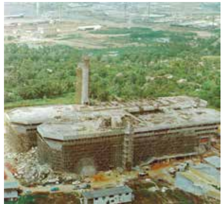
Jurong Town Hall as it was being constructed in 1973.