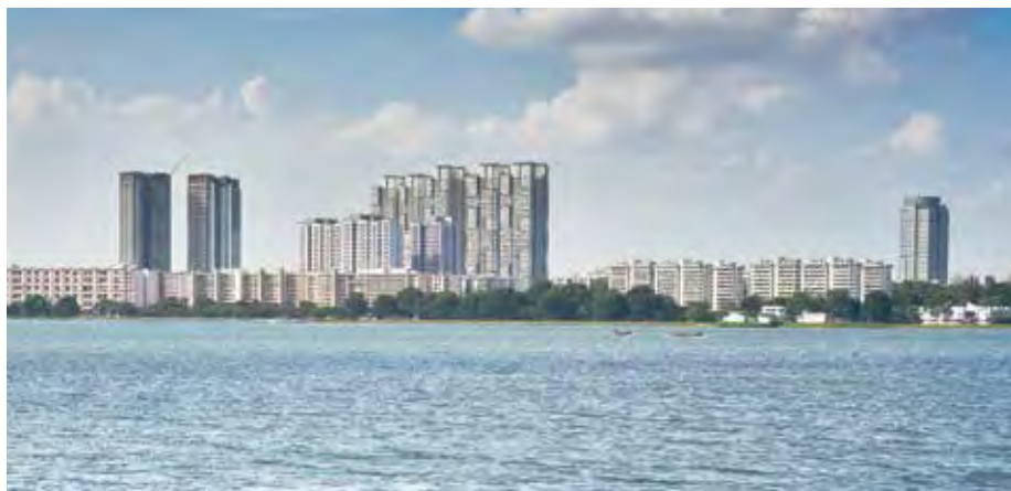
Teban Garden and Pandan Garden estates overlooking the Pandan Reservoir.

Fringes of mangroves, once ubiquitous in the area, remain at the mouth of Sungei Pandan. These hubs of biodiversity are homes to a wide range of bird and sea animals (see page 13).