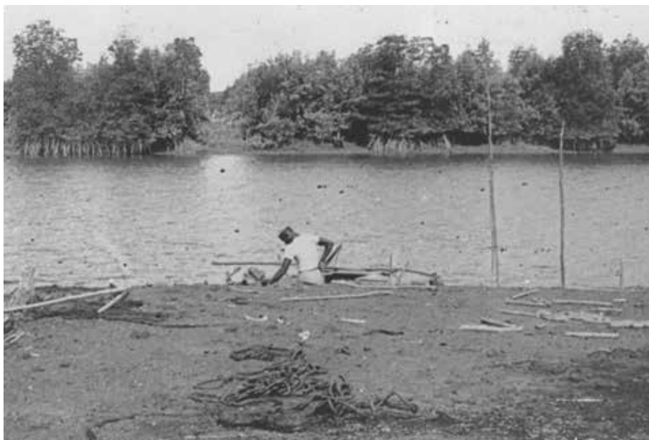
Sungei Jurong, with mangroves on the far bank.