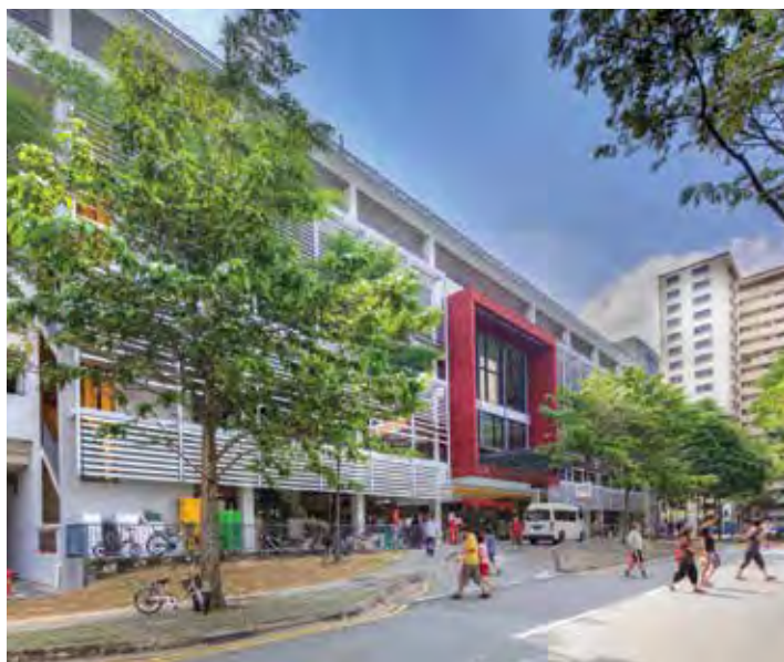
Taman Jurong Market and Food Centre.

On the following pages you will find social attractions, green spaces and industrial locations that were established during the development of Jurong from the 1960s, as well as places that still carry their legacies from farming and kampong days. A number of significant sites are highlighted with heritage trail markers, but other sites detailed only in this booklet are no less interesting and storied. Enjoy exploring Jurong inside out!