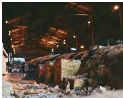
A view of Guan Huat Dragon Kiln.

While the brickworks in Jurong were mainly located between the 10th and 13th milestones, there were other kilns in the area that turned out pottery instead. These kilns were located between the 13th and 15th milestones, and the Gek Poh Village in this vicinity was well known as a place for pottery. The Gek Poh area, and Jurong in general, provided fertile ground for kilns in a literal sense — the viscous earth (known to the Chinese as 'nian tu' — sticky mud) vital to pottery and brick-making was easily found in Jurong.