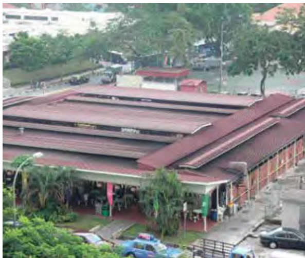
Yung Sheng Food Centre, 2000s.