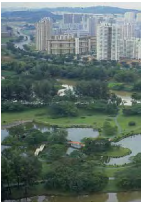
Aerial view of parts of Chinese Garden, Jurong Lake and Jurong West housing estates, 1985.

Through the ages, the Sungei Jurong has been a major local landmark and the economic lifeblood of the community. The earliest