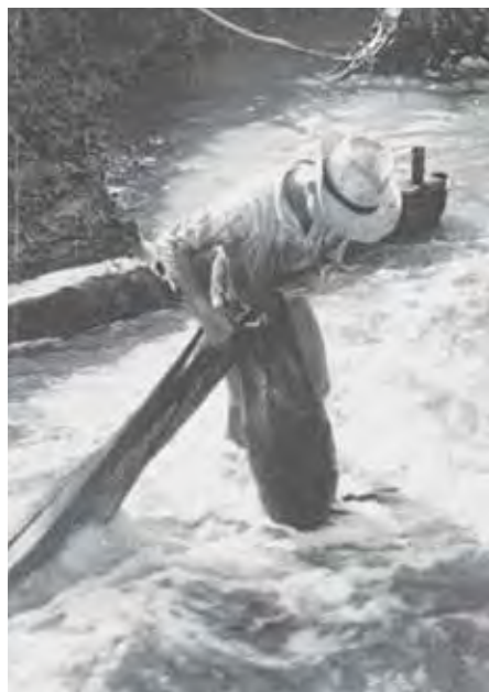
Prawn farming, 1960s.

Prawn ponds were installed in muddy river estuaries and mangrove swamps, making the riverine areas of Jurong a perfect fit. Official estimates in the 1950s counted some 1,000 acres being used as prawn ponds in Singapore, and half of them were located in Jurong.