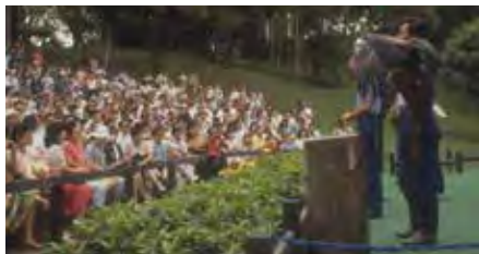
An animal presentation held at the Bird Park, 1989.

One of the most well-loved places in Jurong, the Jurong Bird Park is Singapore's first wildlife park, and was the brainchild of Dr Goh Keng Swee. Impressed by a visit to a zoo with a free-flight aviary in Rio de Janeiro in 1967, he proposed the idea of a bird park for Singapore at the inaugural meeting of the Jurong Town Corporation in June 1968.