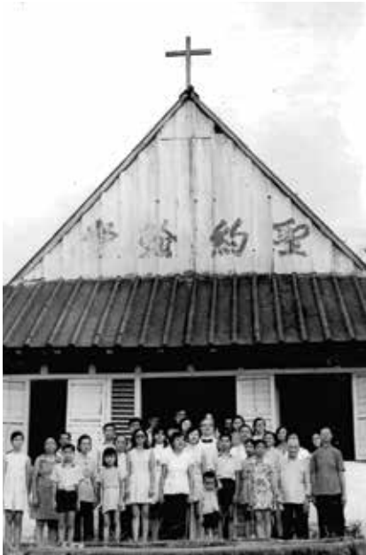
St John's Church and members, early 1960s.