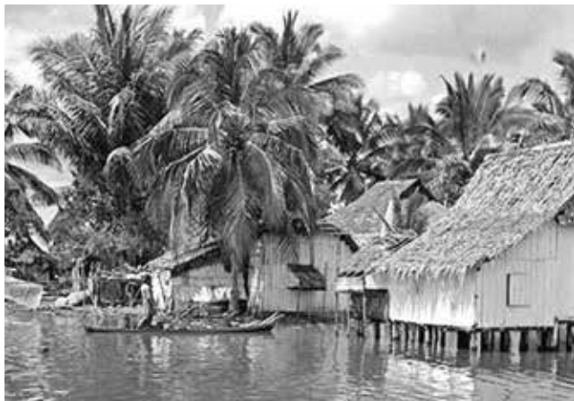
Kampong Teban, a fishing village in Jurong, in the 1950s.

Captain Franklin and Lieutenant Jackson's 1828 map details a number of natural features in Jurong