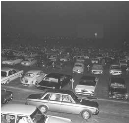
The Jurong Drive-In Cinema on opening night, 14 July 1971.