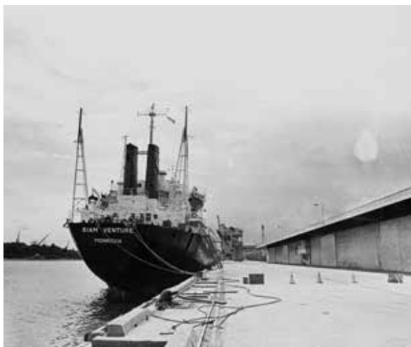
Jurong Port, 1975.

Officially beginning operations in 1965 with two ship berths, Jurong Port handled a diverse range of cargo, including steel plates, copper slag, clinker (stony residue from coal burning or furnaces), metals, cement, machinery, raw sugar, potash, grain, beans, seeds, industrial chemicals, scrap iron, timber and farm animals. The Port was run by the EDB, with management assistance from the Port of Singapore Authority (PSA), before coming under the charge of the Jurong Town Corporation in 1968.