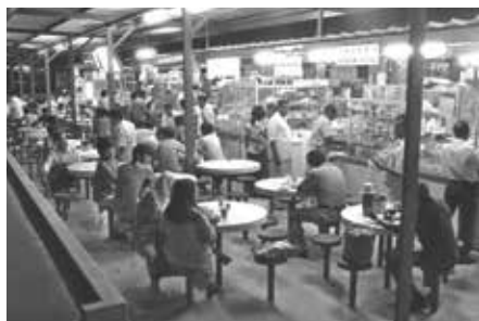
Night scene at the Corporation Drive Food Centre, 1975.

stalls in the Centre. Hawkers who successfully balloted for a stall were required to undergo medical tests, following a cholera outbreak at the time.