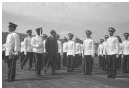
Defence Minister Dr Goh Keng Swee reviewing the first officers' commissioning parade at SAFTI, Pasir Laba Camp, on 16 July 1967.

Where the old SAFTI generally trained officers for the army, navy and air force separately, the new institute brought training for the Republic of Singapore Air Force, the Republic of Singapore Navy and the Singapore Army together to enhance operational integration and understanding.