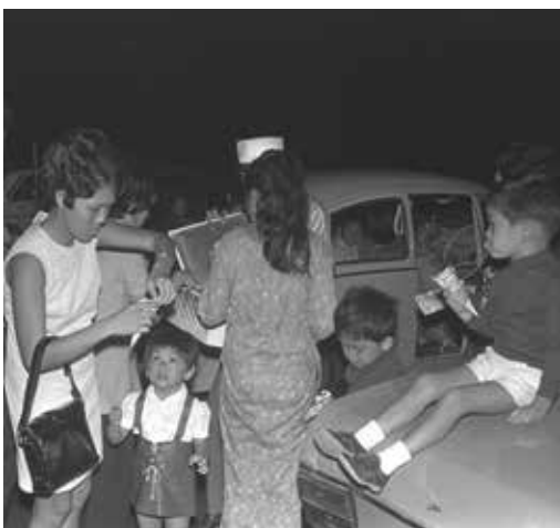
Families buying ice-cream from a vendor at the cinema.

"This movie was such a big hit that all the tickets were sold out in the regular theatres in town; and so in desperation, my brothers and I headed for the Jurong Drive-In."