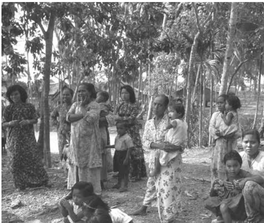
Villagers standing by rubber trees on Pulau Samulun, 1963.

The Orang Laut shared a symbiotic relationship with the more settled Malays, often serving as the naval forces of a number of Malay kingdoms. However, the two peoples were culturally distinct until the 20th century, when the Orang Laut began to be assimilated into Malay communities in Singapore, Malaysia and Indonesia.