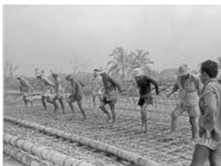
Workers rolling up cane for a kelong in Tuas Village, 1970s.

By the 1940s, there were some 2,000 Chinese and Malay fishermen living in Tuas Village. Former Tuas Village resident Li Xi Mei remembered: