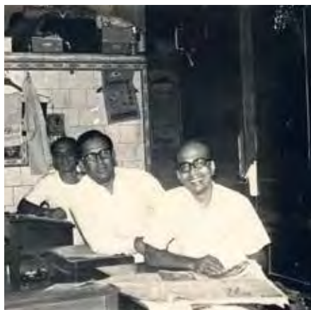
Chettiar moneylenders in their office, 1960s.