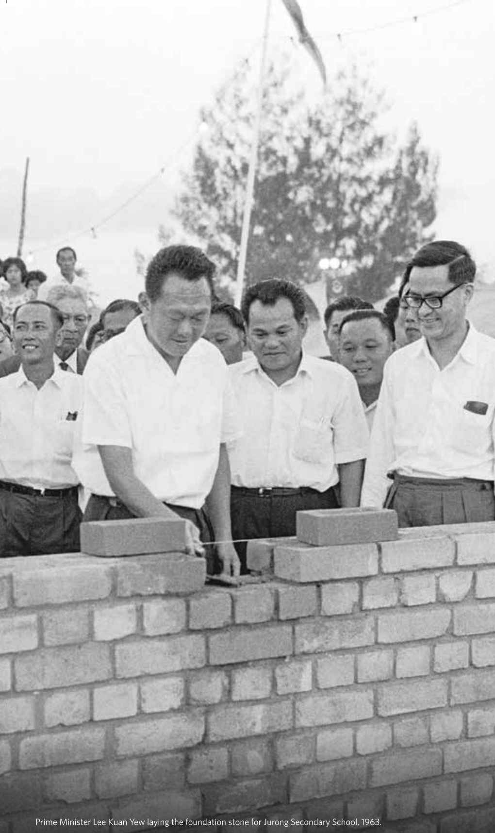
Prime Minister Lee Kuan Yew laying the foundation stone for Jurong Secondary School, 1963.

The Jurong Heritage Trail is part of the National Heritage Board's ongoing efforts to document and present the history and social memories of places in Singapore. We hope this trail will bring back fond memories for those who have worked, lived or played in the area, and serve as a useful source of information for new residents and visitors.