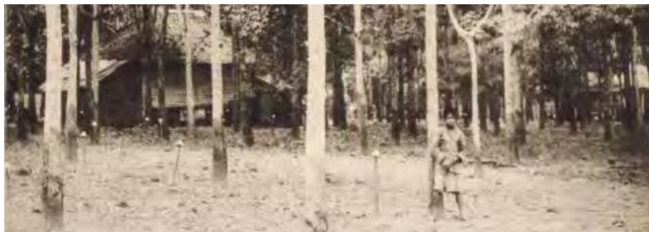
A rubber plantation in Singapore, 1900s.

Other rubber holdings in Jurong included the Bajau, Jurong, Lokyang, Yun Nam, Chong Keng,