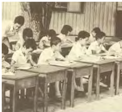
Students having lessons in the outdoors, 1930-40s.

With the population of Jurong growing after its development as a new town and industrial estate in the 1960s, the school needed to expand to accept more students. A two-night variety show was put on at the Happy World, helping raise funds for the school to grow. By 1982, Joo Long had an enrolment of 831 students. Two years later, Joo Long was converted into a government school and renamed Rulang Primary School.