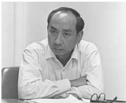
Dr Goh Keng Swee.

The high unemployment, dismal economic prospects of large swathes of the population and the looming decline of entrepot trade presented an economic picture that Dr Goh Keng Swee, the Minister for Finance, regarded as "wretched". His conclusion was not one simply arrived at through the cold analysis of economic data; growing up, Dr Goh had seen the effects of the Great Depression of the 1930s on his father, a rubber plantation manager. After the Japanese Occupation, while at the Social Welfare Department, he set up the 'Peoples' Restaurants' that helped feed the needy and later initiated a study of the income levels of the urban working class and issues of poverty.